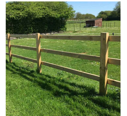
IMAGE OF TIMBER POST & RAIL FENCE