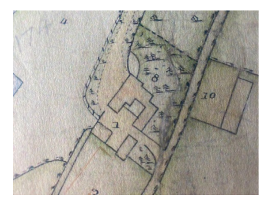
Early C20 plan