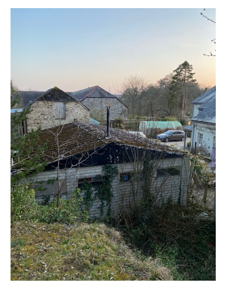
Photo of garage from the North side with the barn and the housing development (2006) beyond