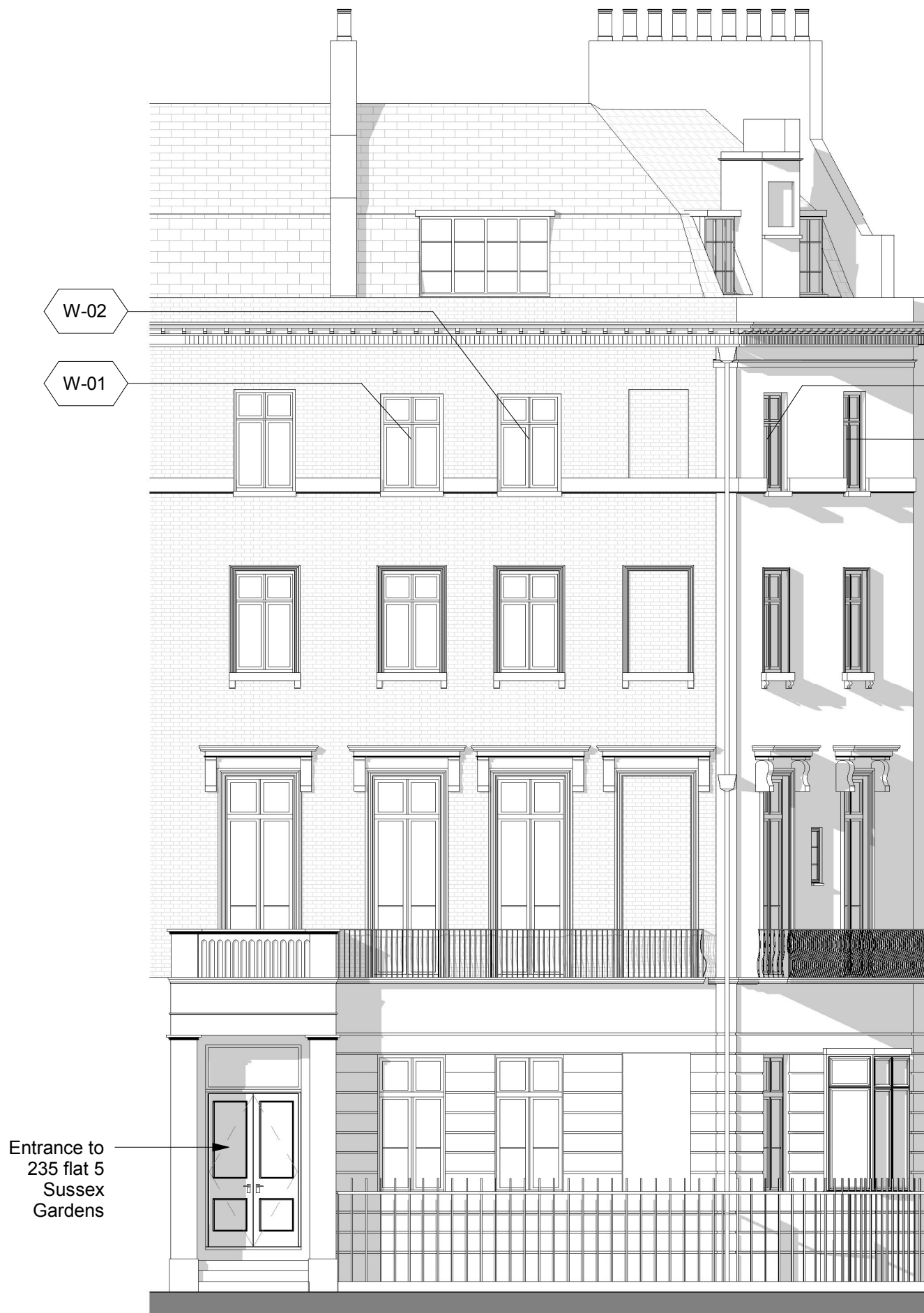
1 Existing North West Elevation 1 : 100