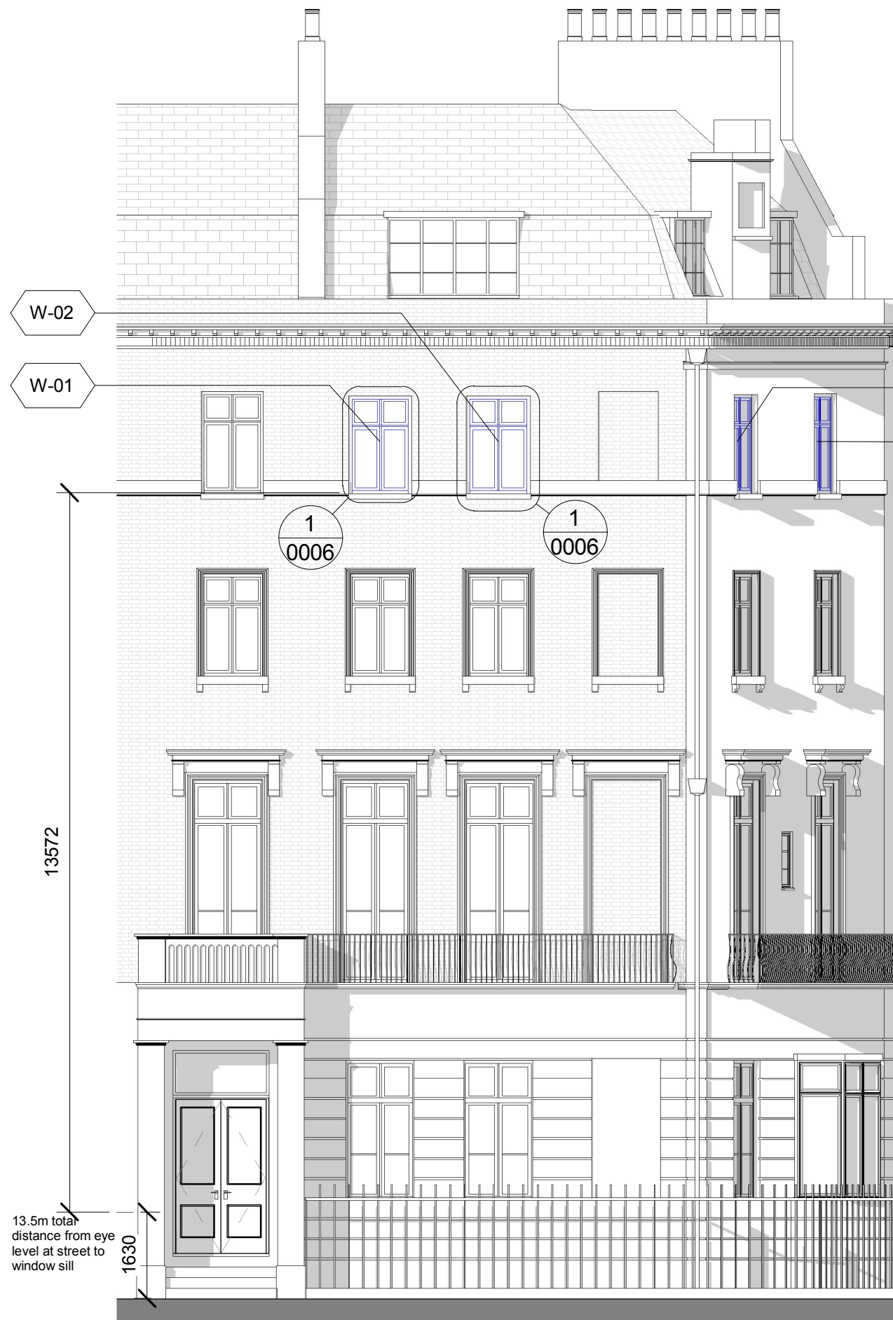
1 Proposed North West Elevation 1 : 100