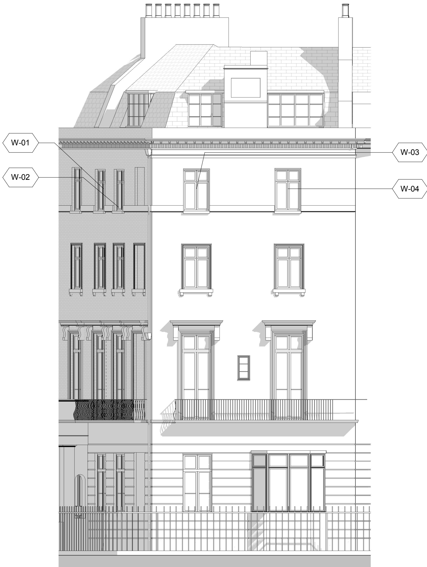
1 Existing South West Elevation 1 : 100