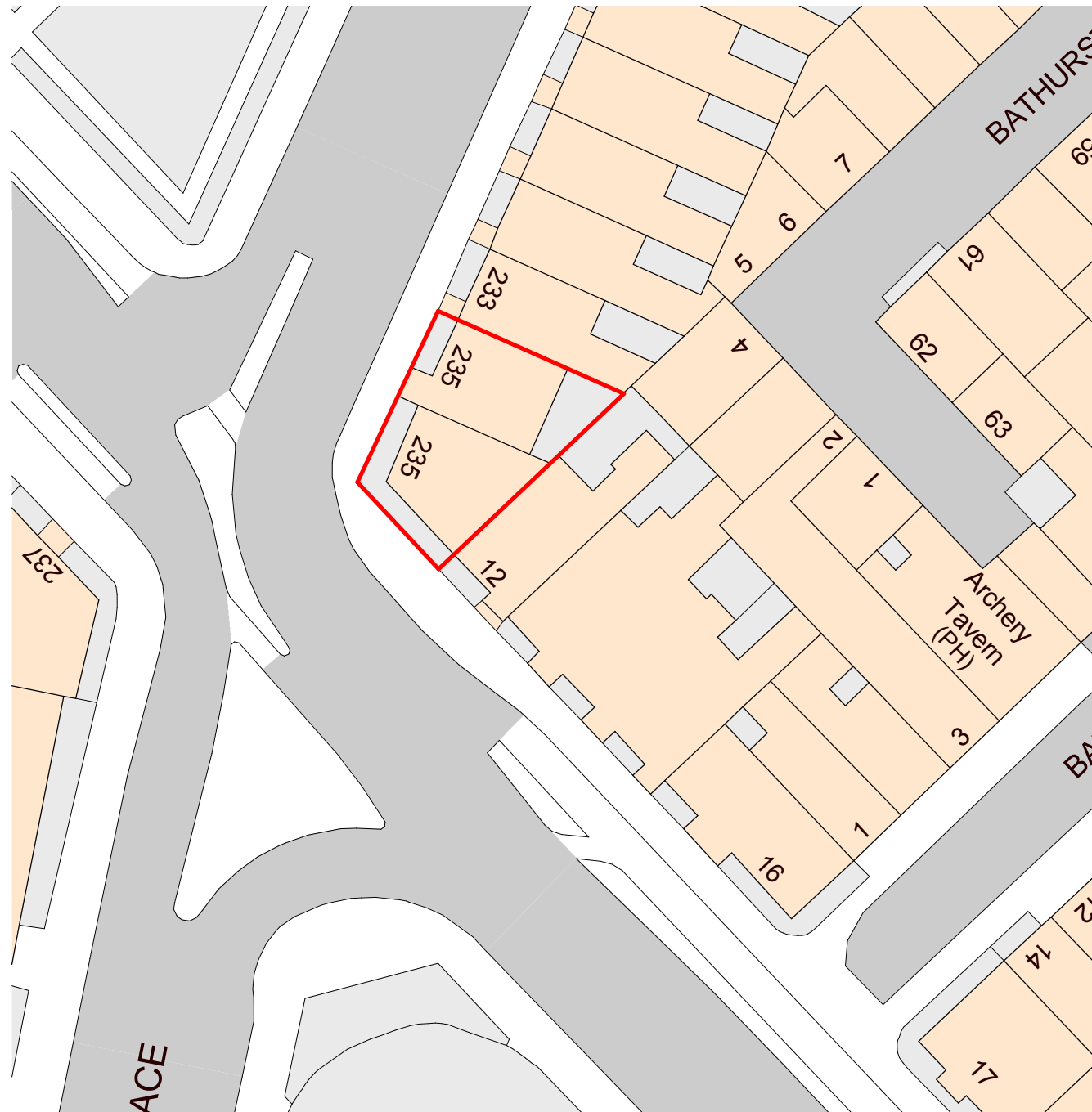
2 Block Plan 1 : 500