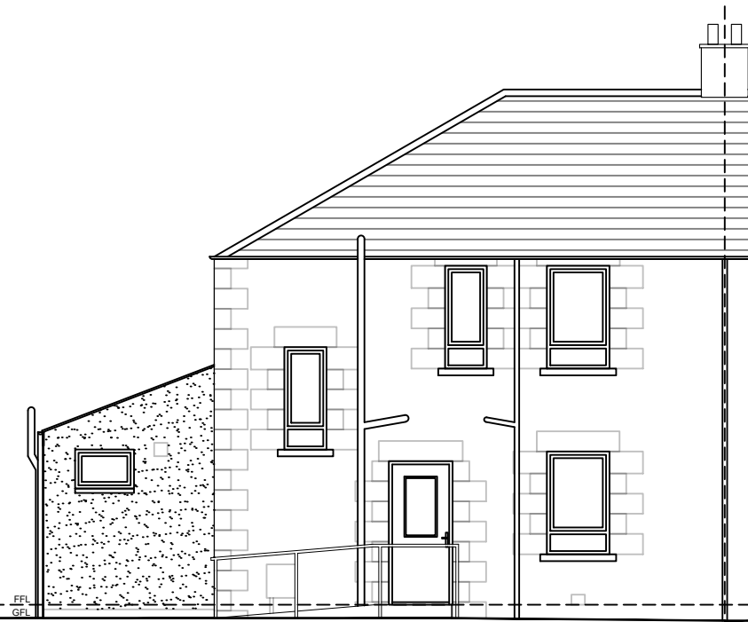
Rear Elevation No. 35