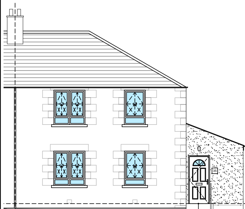
New Door Front Elevation No. 35

New Doors Hall & Tawse 44mm thick 100% FSC Certified 'Crimecheck Plus Extremetherm' high efficiency Timber Door Pre-finished - RAL 8015 chestnut brown