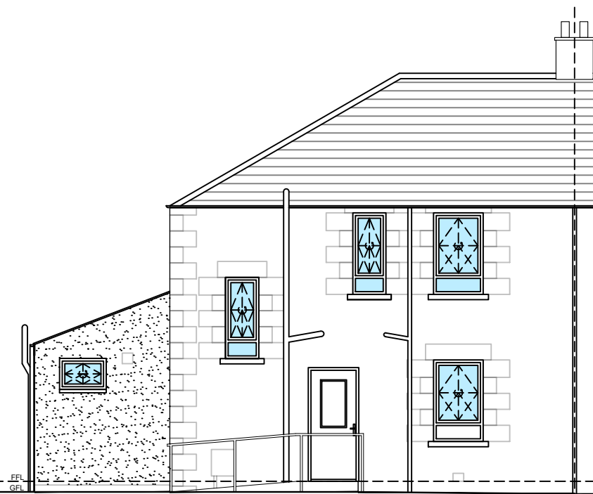
Rear Elevation No. 35