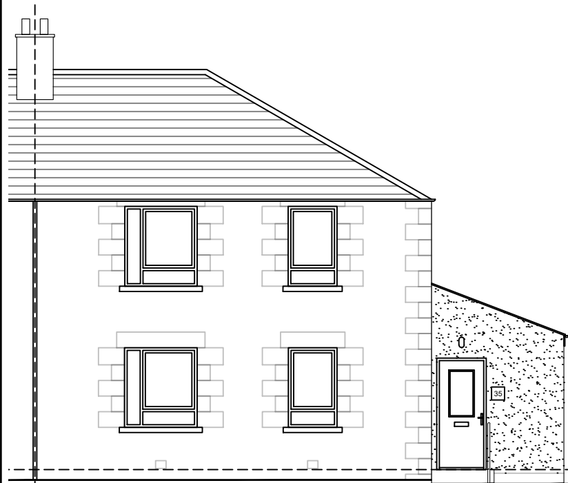
Front Elevation No. 35