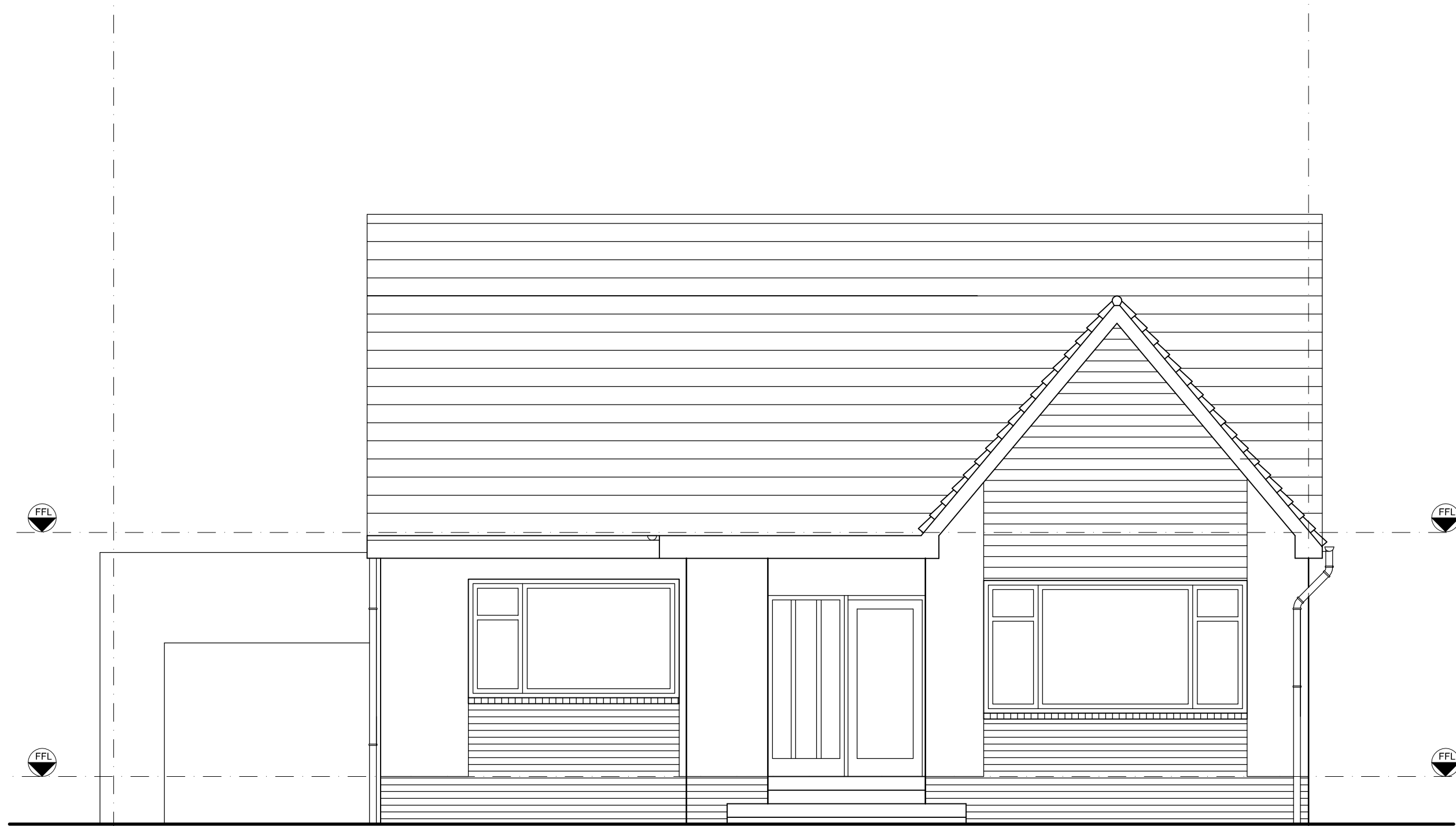
NORTH ELEVATION 1:50