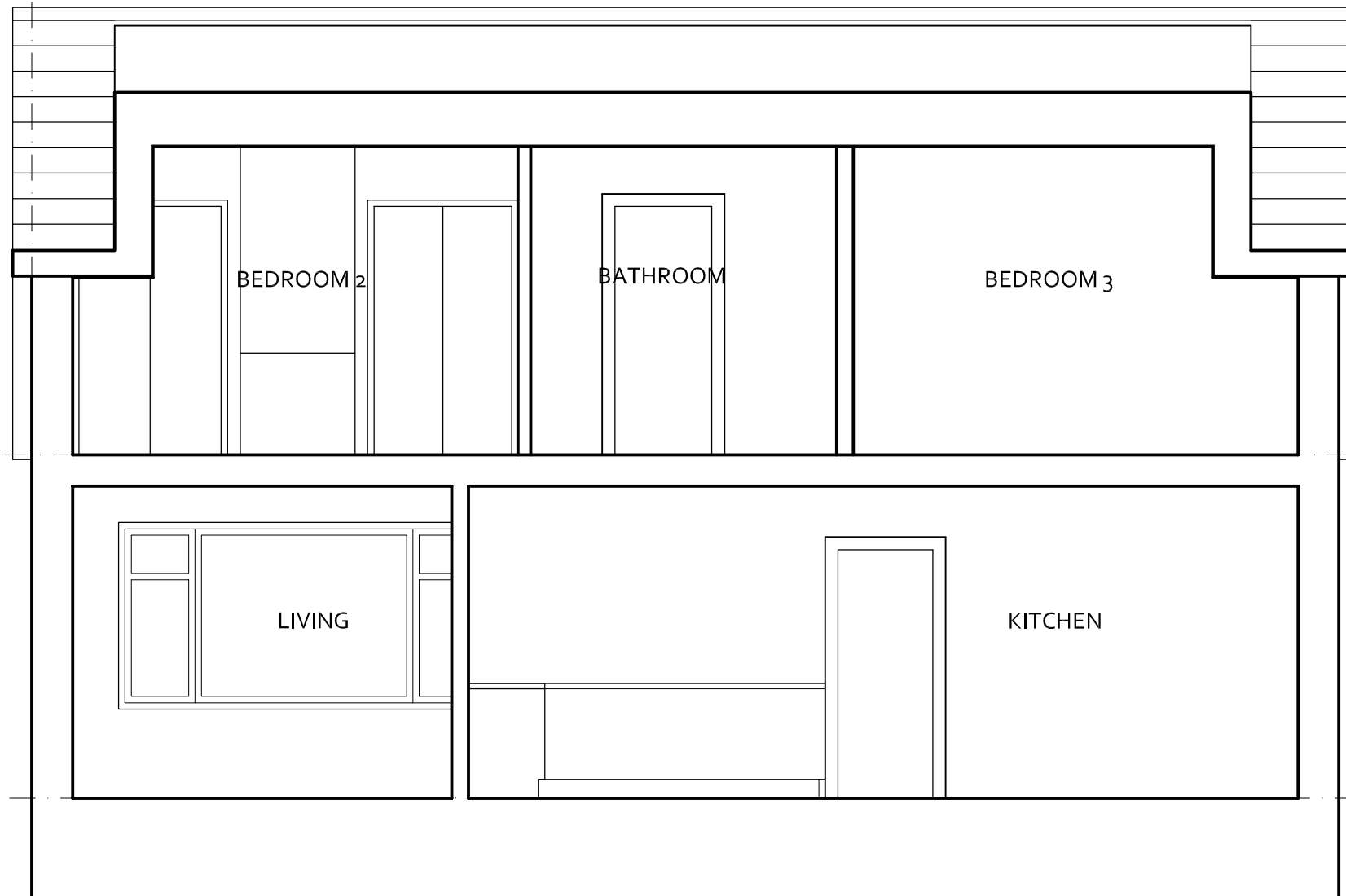
SECTION A-A 1:50