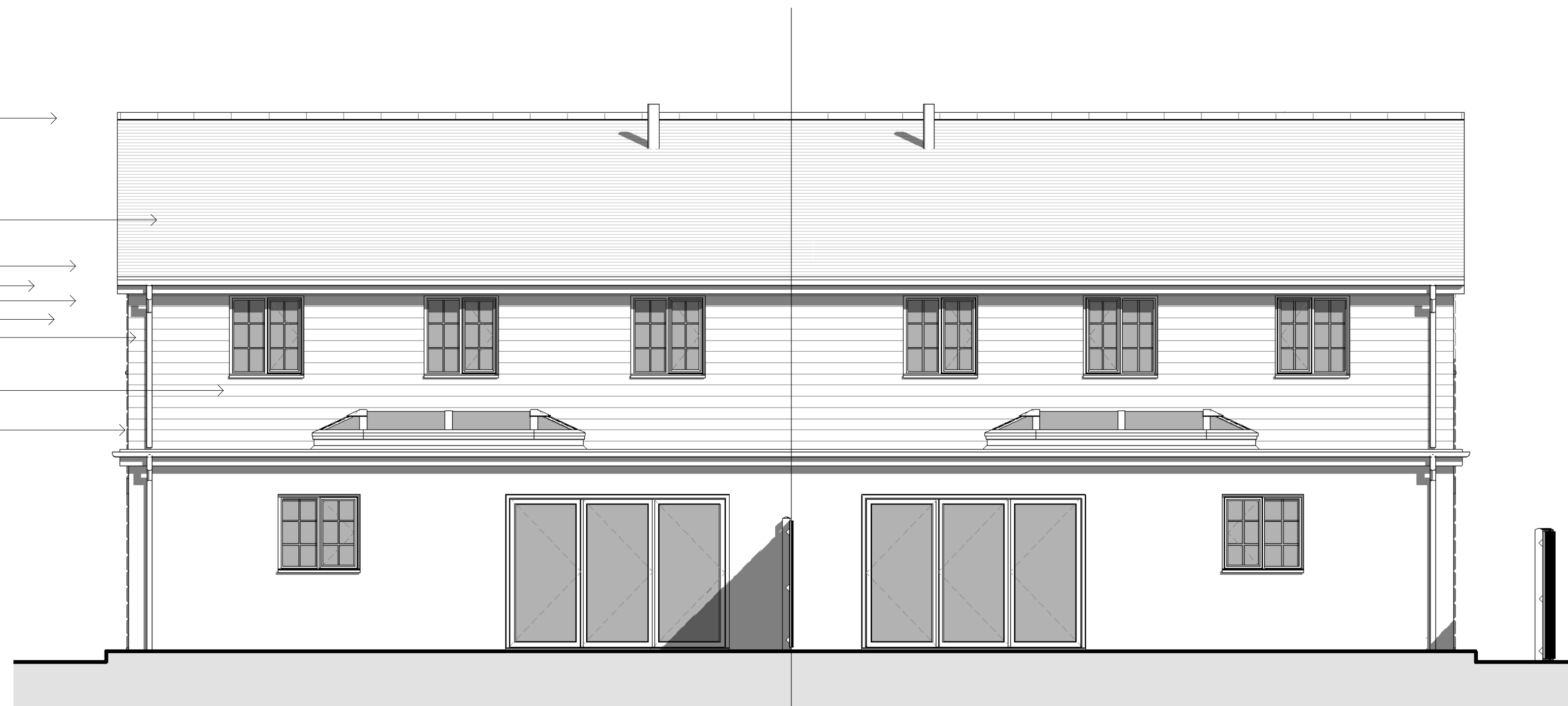
2 Enlarged South West Elevation 1 : 50

Terracotta Ridge Tiles Natural Slate PVC Fascia & Soffits PVC Rainwater Goods PVC Windows Timber Cladding PVC Lantern Light PVC Bi-folding Door Render Finish