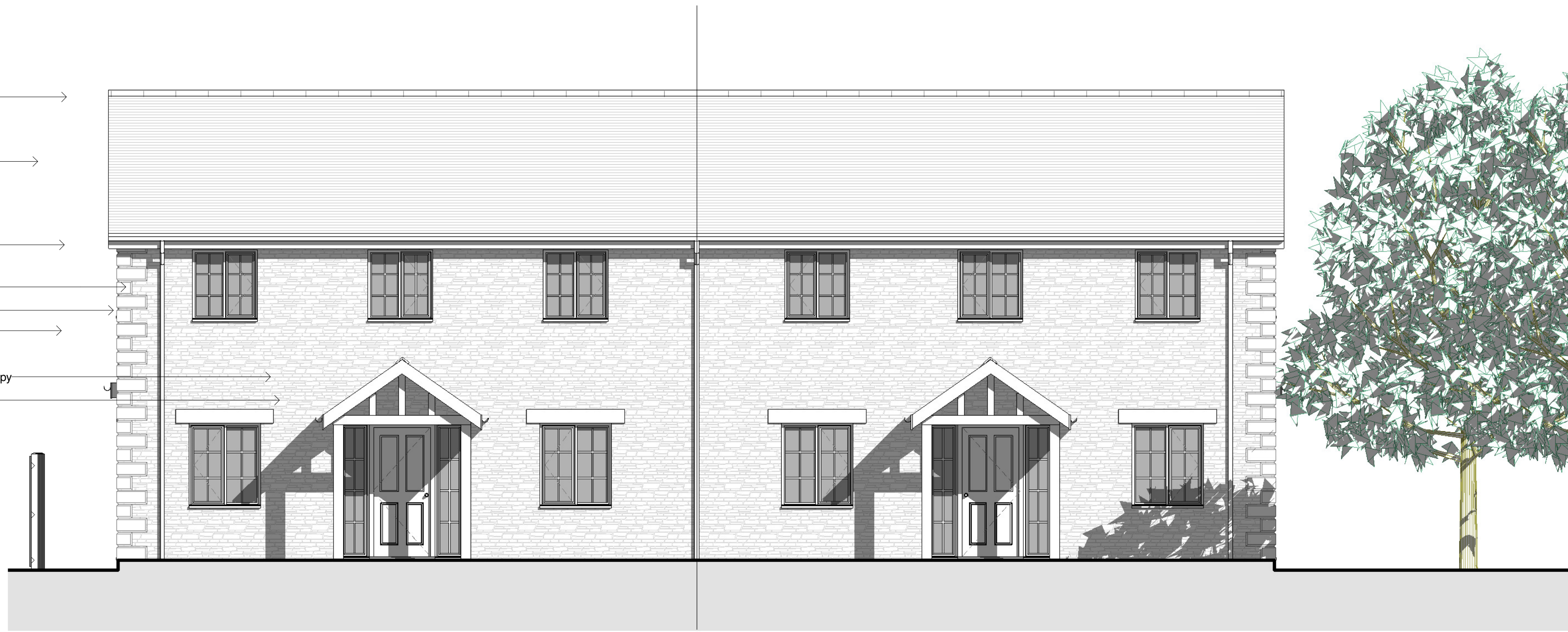
1 Enlarged North East Elevation 1 : 50

Terracotta Ridge Tiles Natural Slate PVC Fascia & Soffits PVC Windows PVC Rainwater Goods Natural Stone Natural Slate, Timber Canopy Composite Entrance Door