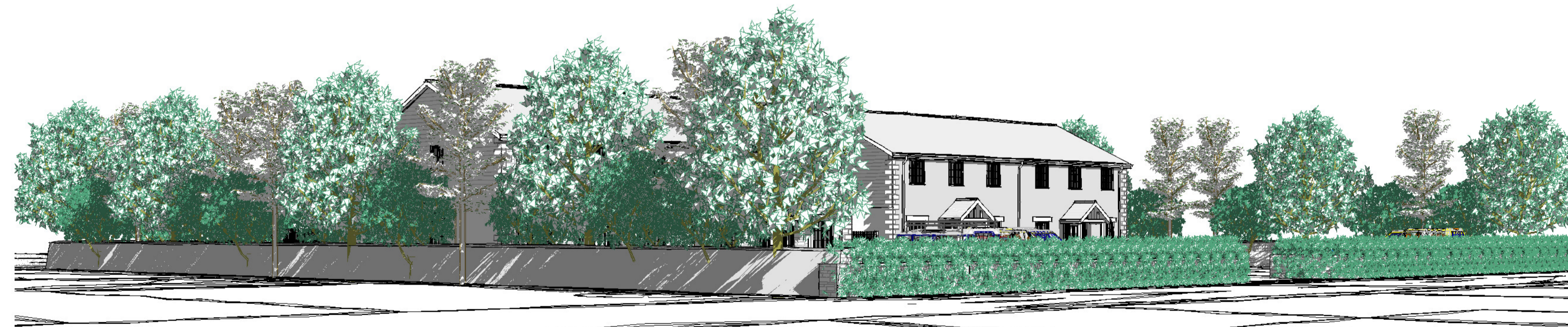
3 3D View 2

Cornwall Planning Group Head Office: Chi Gallos, Hayle Marine Renewables Business Park, North Quay, Hayle, Cornwall, TR27 4DD Phone: +44 (0)1736 448 500 Email: office@cornwallplanninggroup.co.uk Web: www.cornwallplanninggroup.co.uk