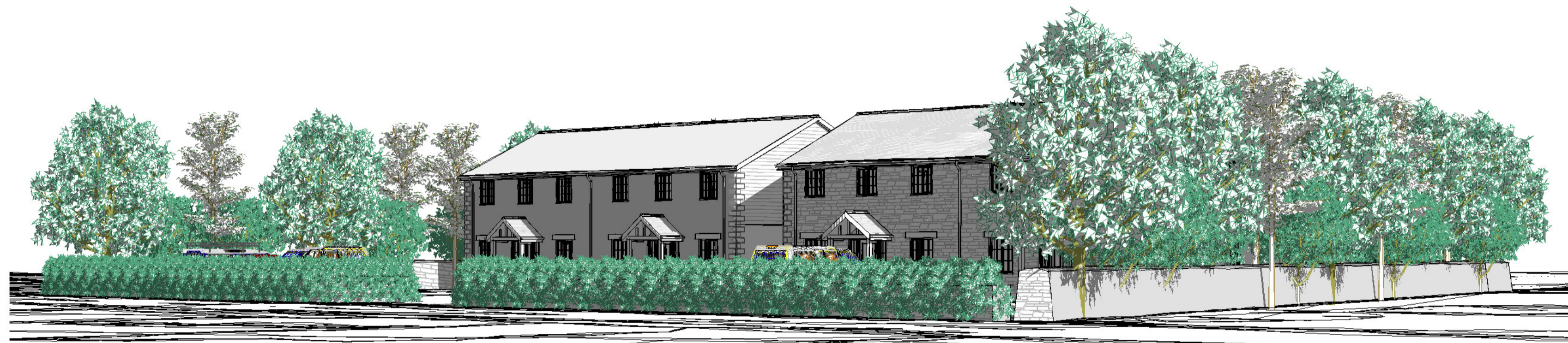
2 3D View 1