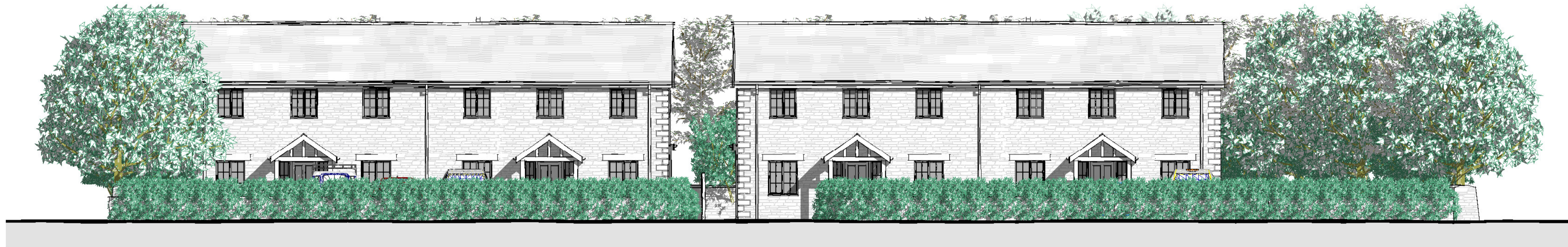
1 Street Scape Elevation 1 : 100