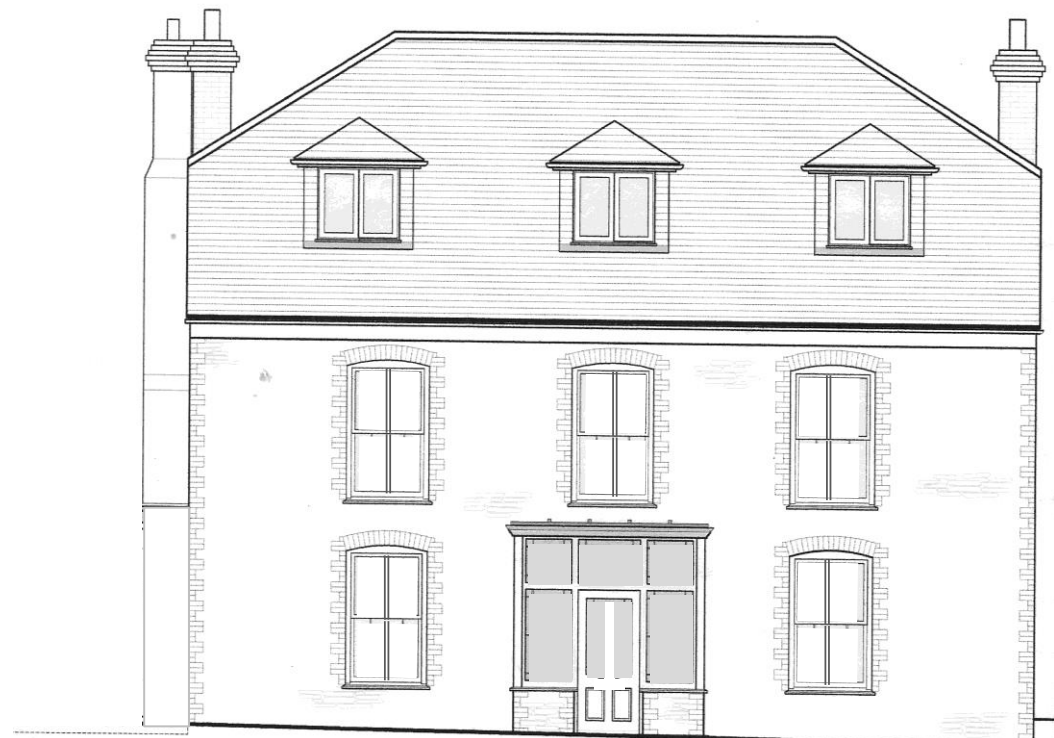
Existing South Elevation