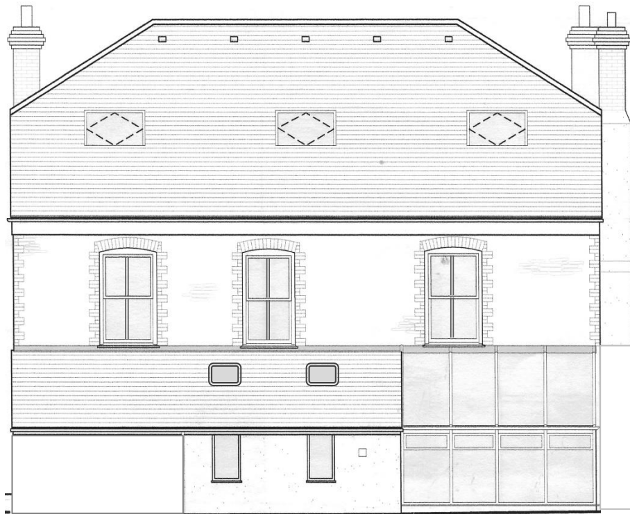
Existing North Elevation

Existing conservatory. uPVC construction, double glazed sides and door, roof twin wall polycarbonate