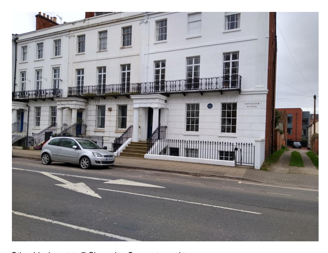
Other block next to 7 Clarendon Square toward town