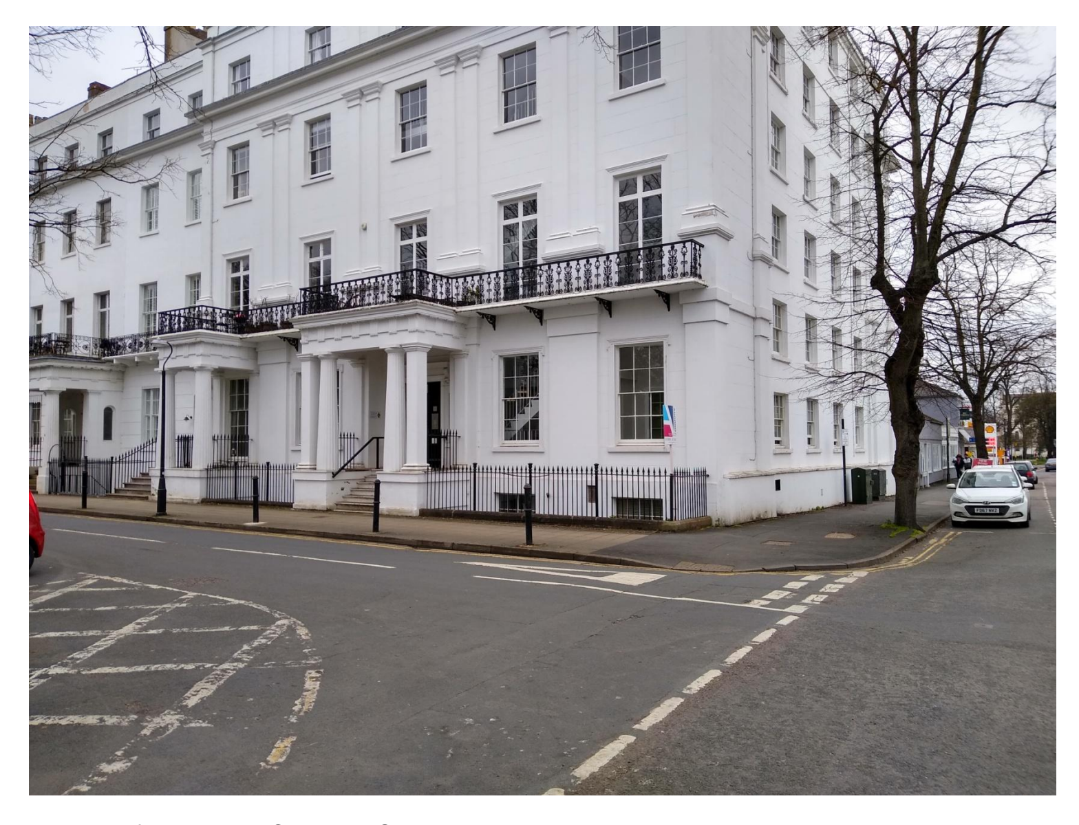
East side of main part to Clarendon Square