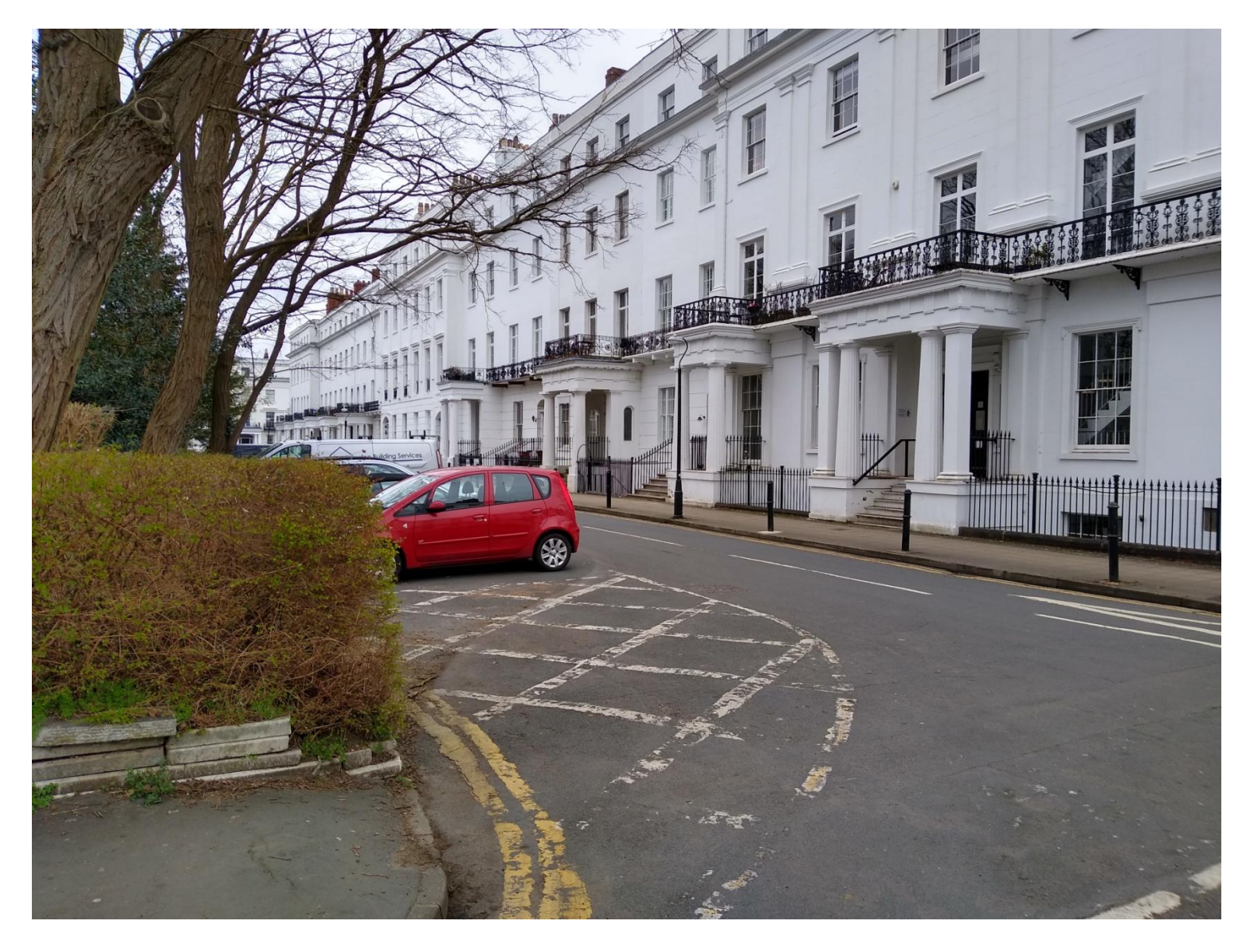
Main East side of Clarendon Square