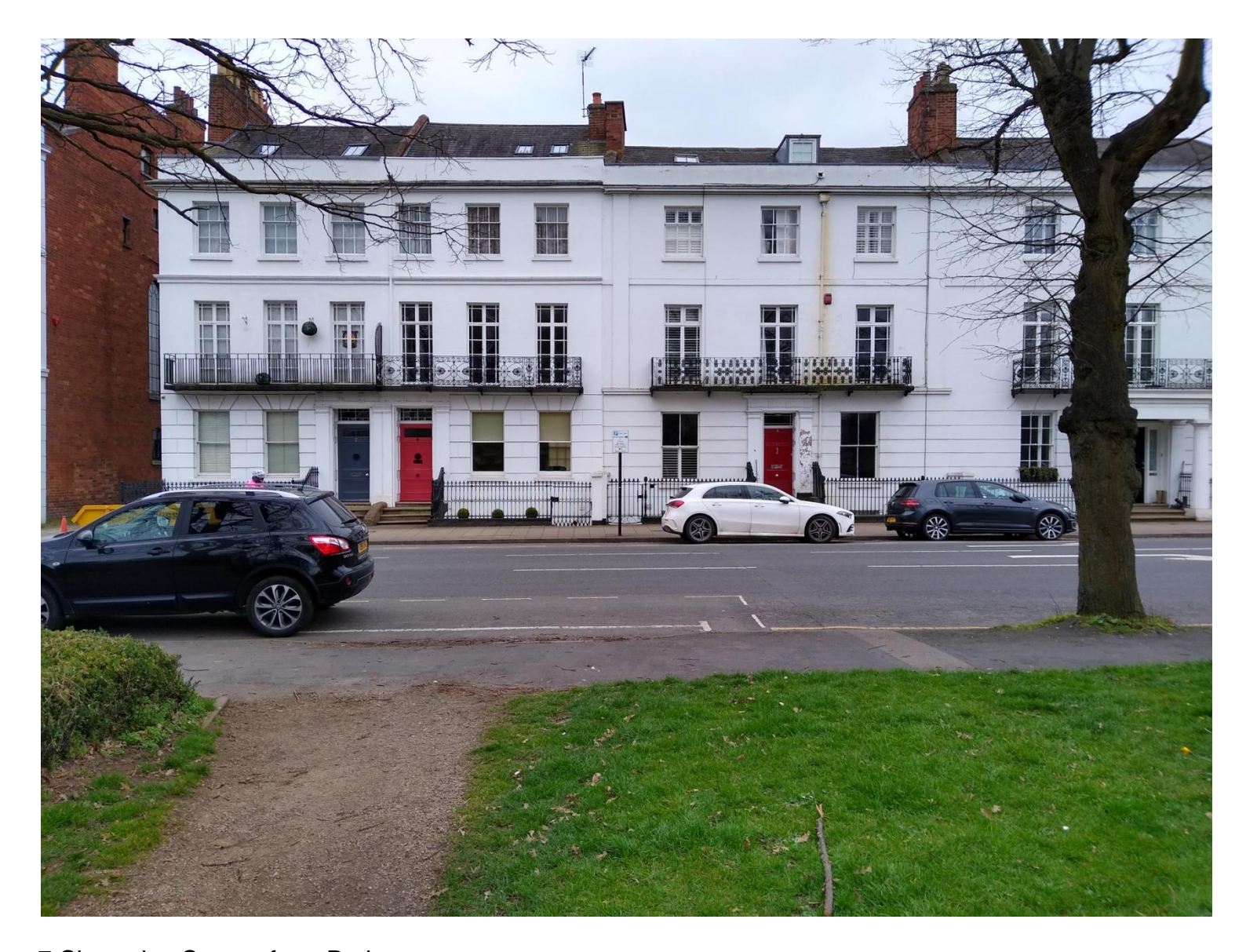
7 Clarendon Square from Park