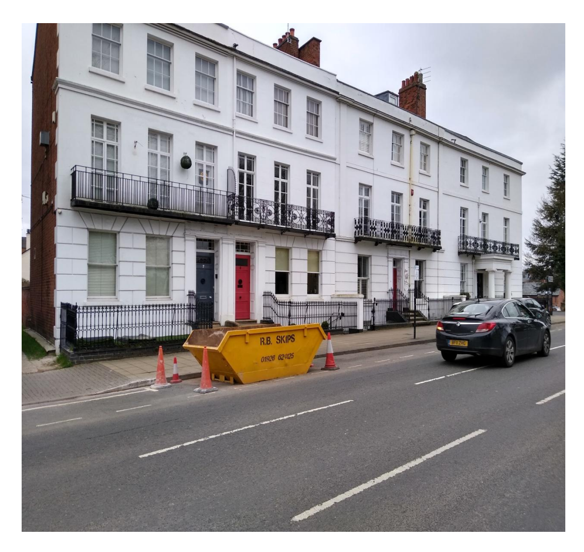
Block of four including 7 Clarendon Square