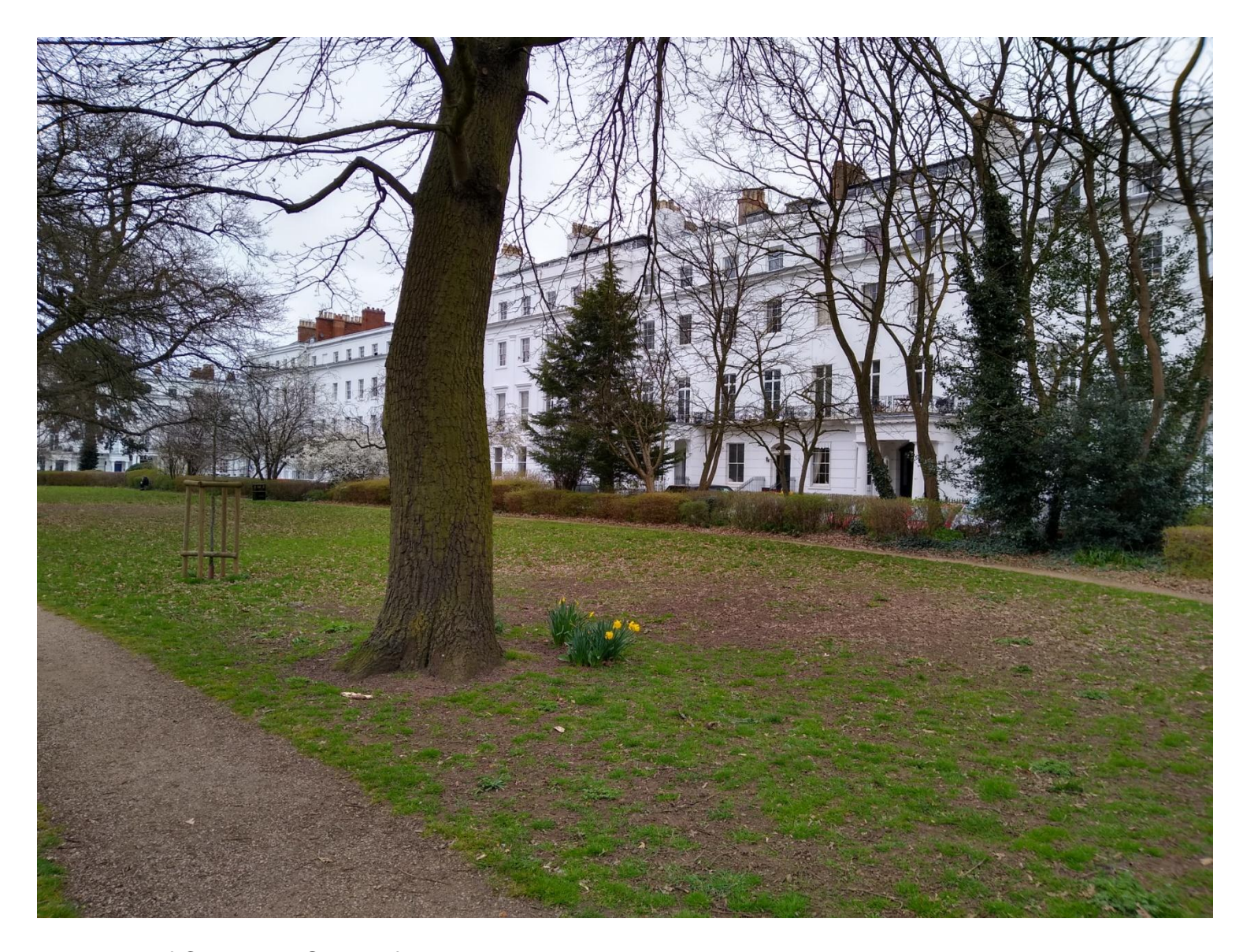
Main view of Clarendon Square from park