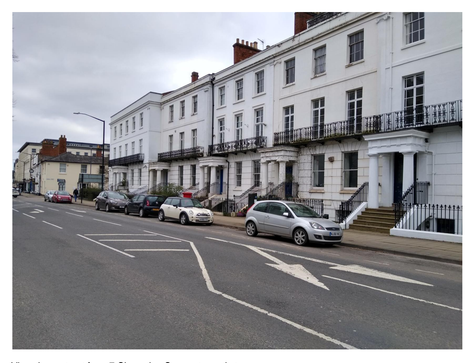
View down street from 7 Clarendon Square towards town