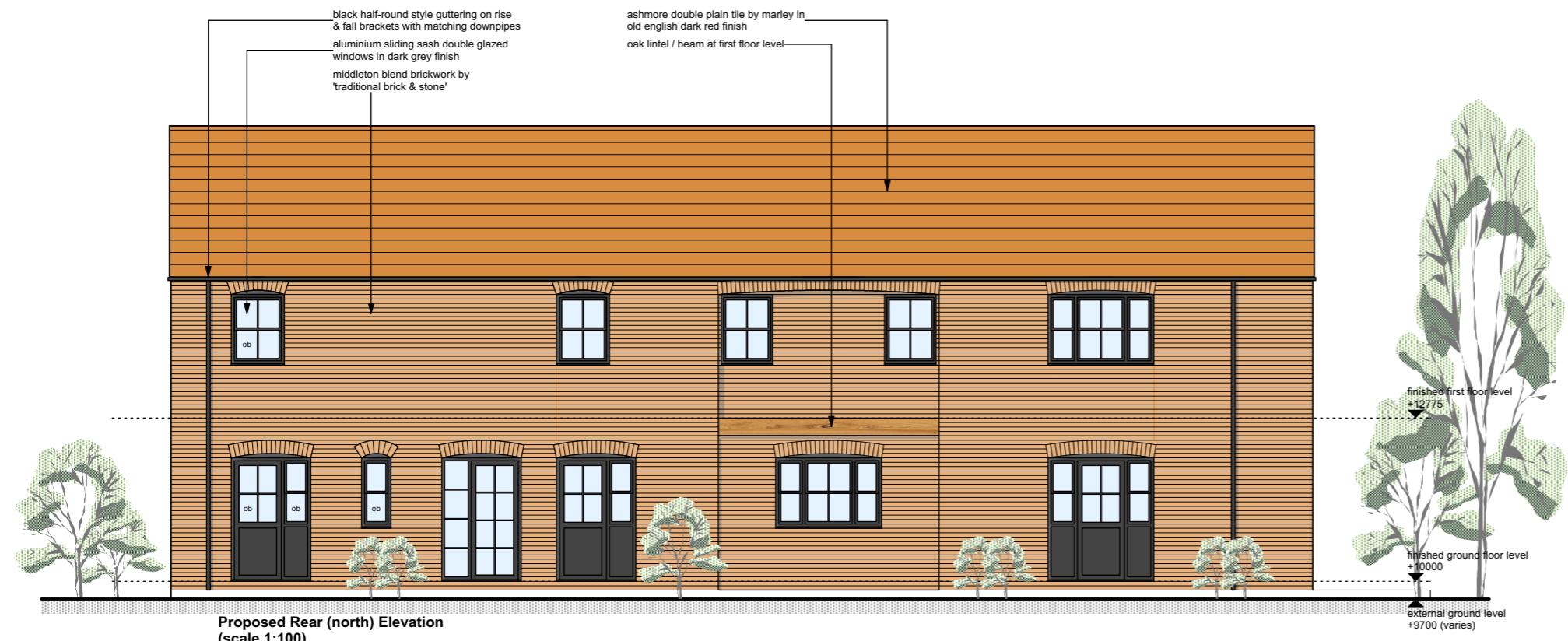
Proposed Rear (north) Elevation (scale 1:100)

revision g : 18 September 2019 drawings prepared for planning application