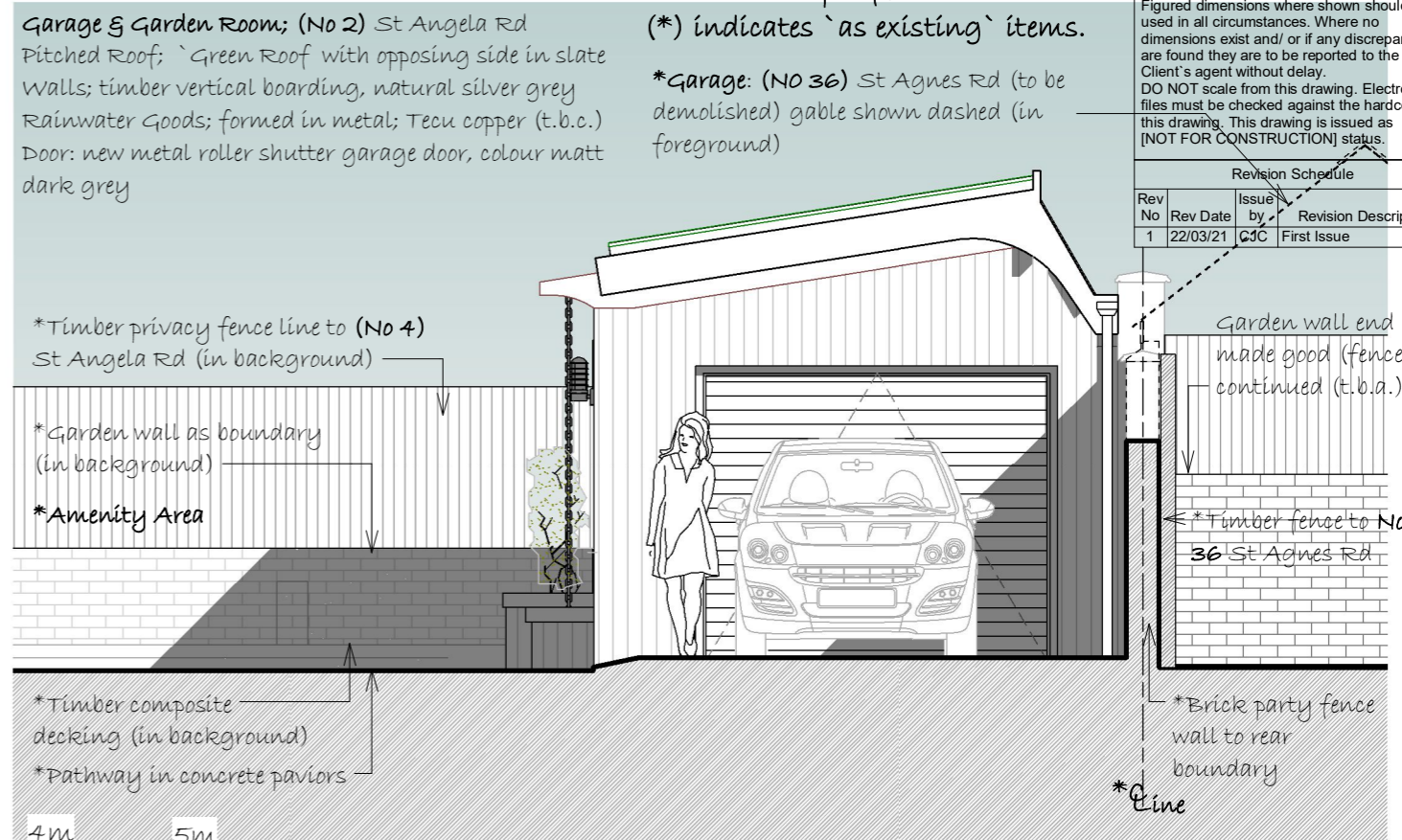
FRONT (NORTH) ELEVATION AS PROPOSED 1:50

NOTE: Items pre-fixed with asterisk (*) indicates 'as existing' items.