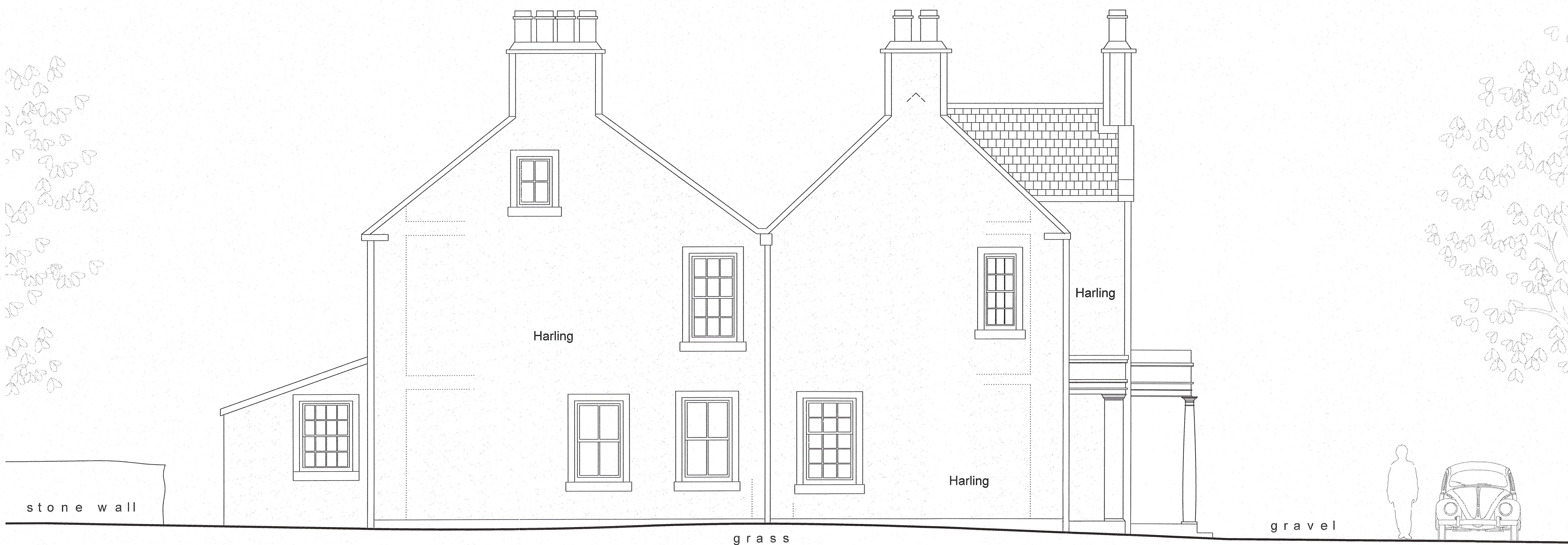
GARDEN SOUTH WEST GABLE ELEVATION 1:50