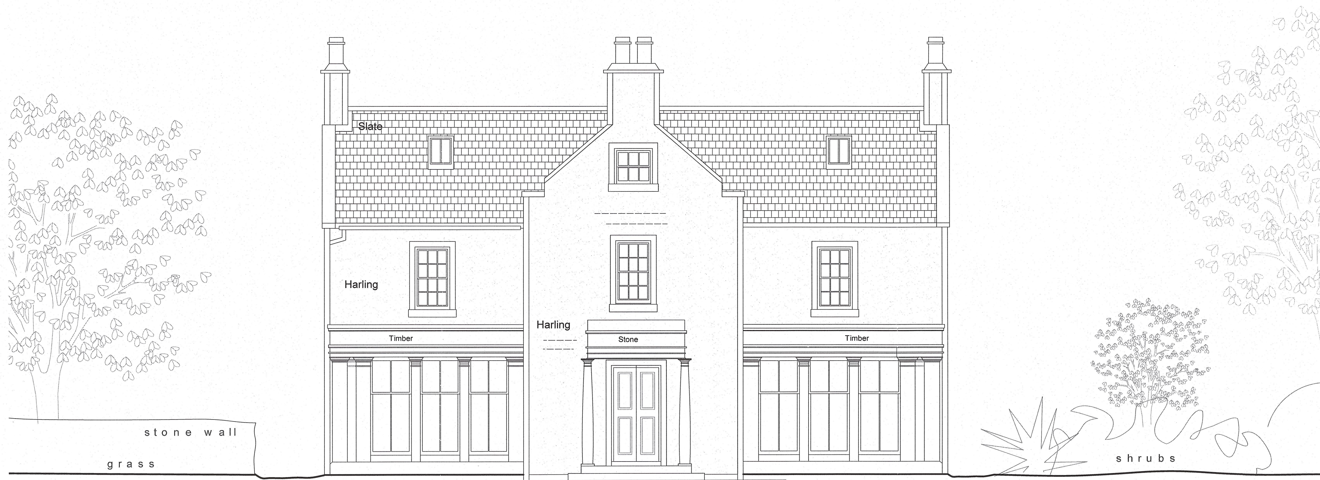
FRONT SOUTH EAST ELEVATION 1:50

REAR NORTH WEST ELEVATION + ROAD SIDE NORTH EAST ELEVATION