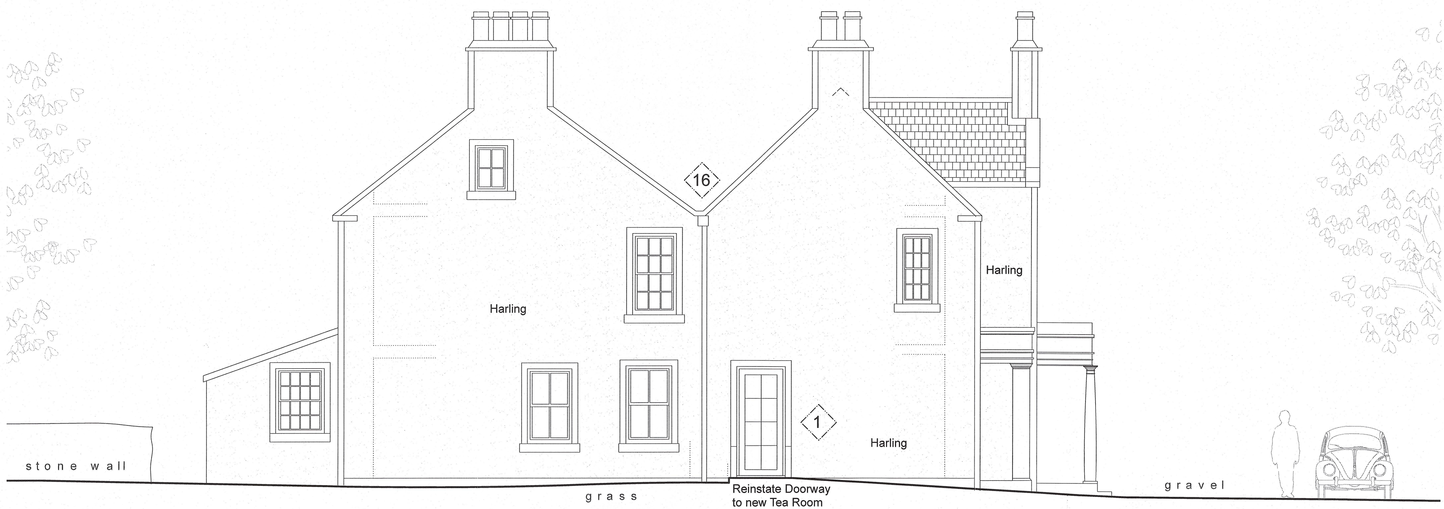
GARDEN SOUTH WEST GABLE ELEVATION 1:50