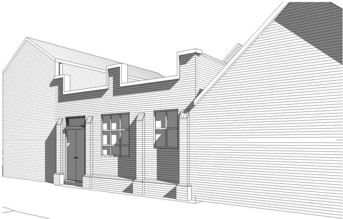
1 Front Elevation 3D PA102