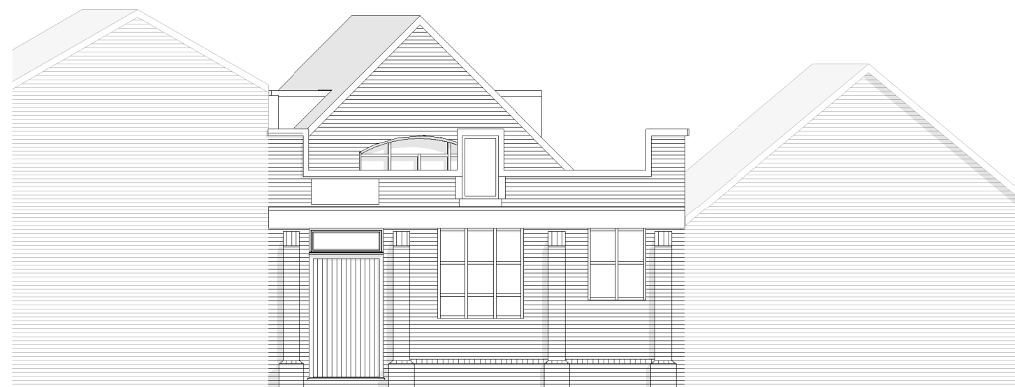
Penman Spicer Community Hall