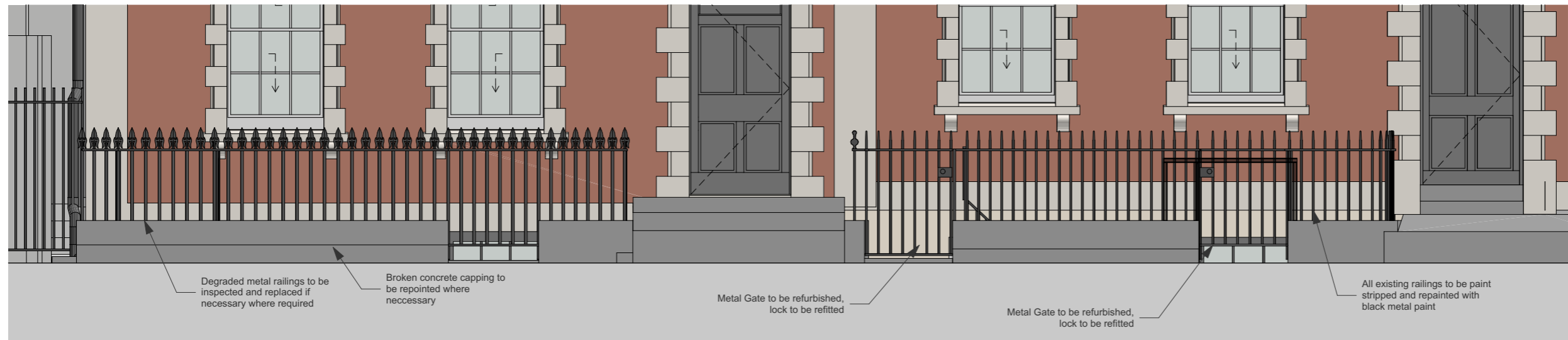
Proposed Railing Elevation 1:50