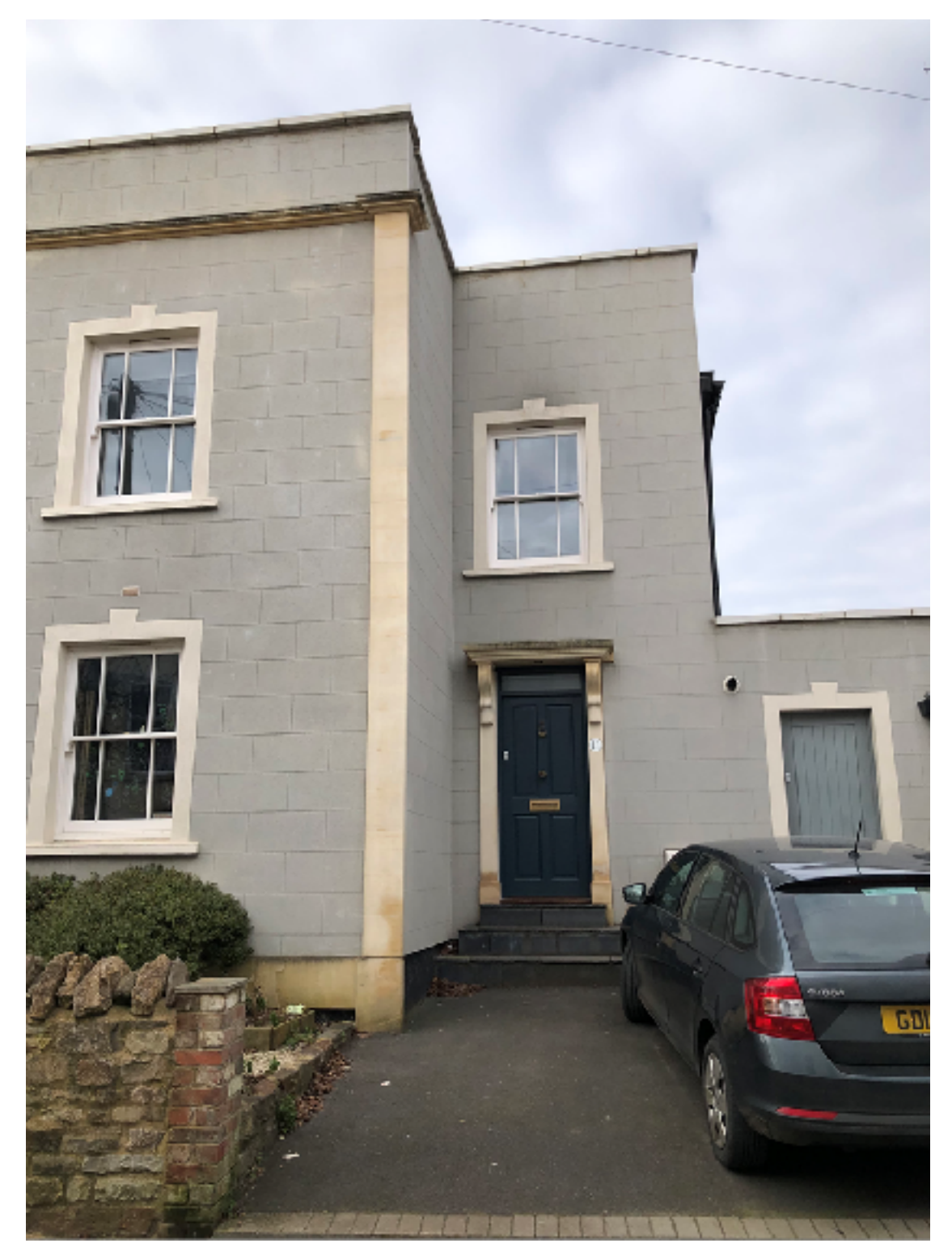
Image 1: View from front of property - solar panels not visible from road