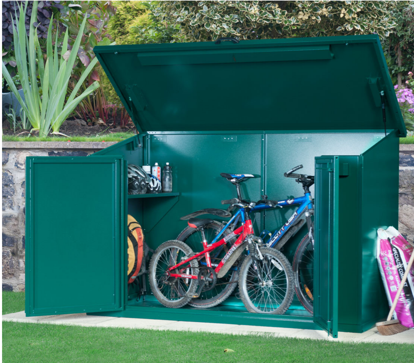
View of steel bike store

Weight: 114kg (18 stone) Door Aperture: 1350mm (4ft 5")