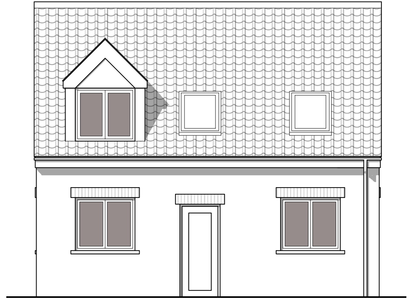
Front (West) elevation