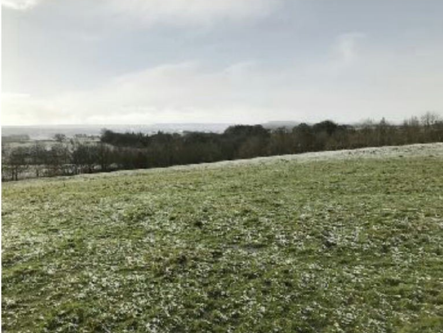
Photo taken from site location facing South- west

Please insert photo and confirm aspect/direction from which taken: