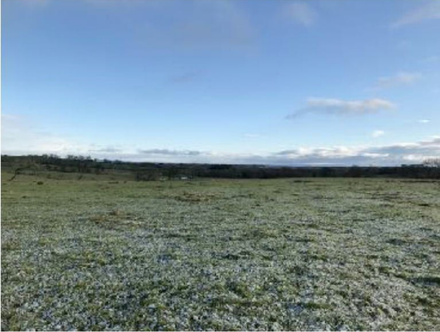
Pond location facing South

Please insert photo and confirm aspect/direction from which taken: