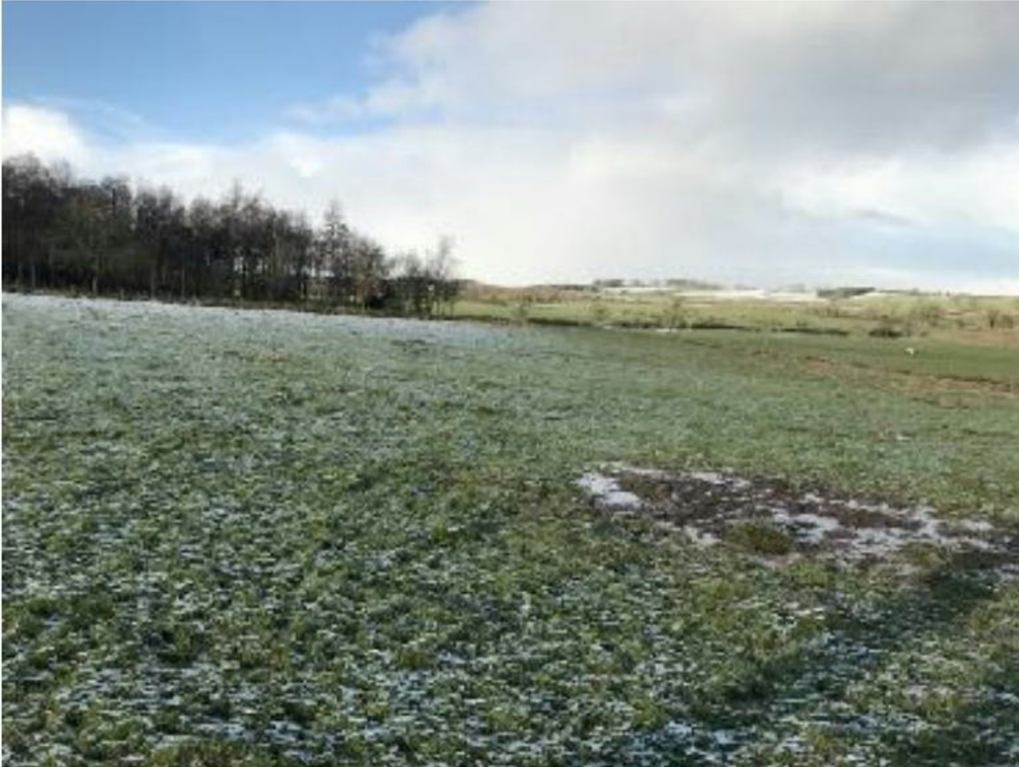
Location of the pond facing North-West

Please insert photo and confirm aspect/direction from which taken: