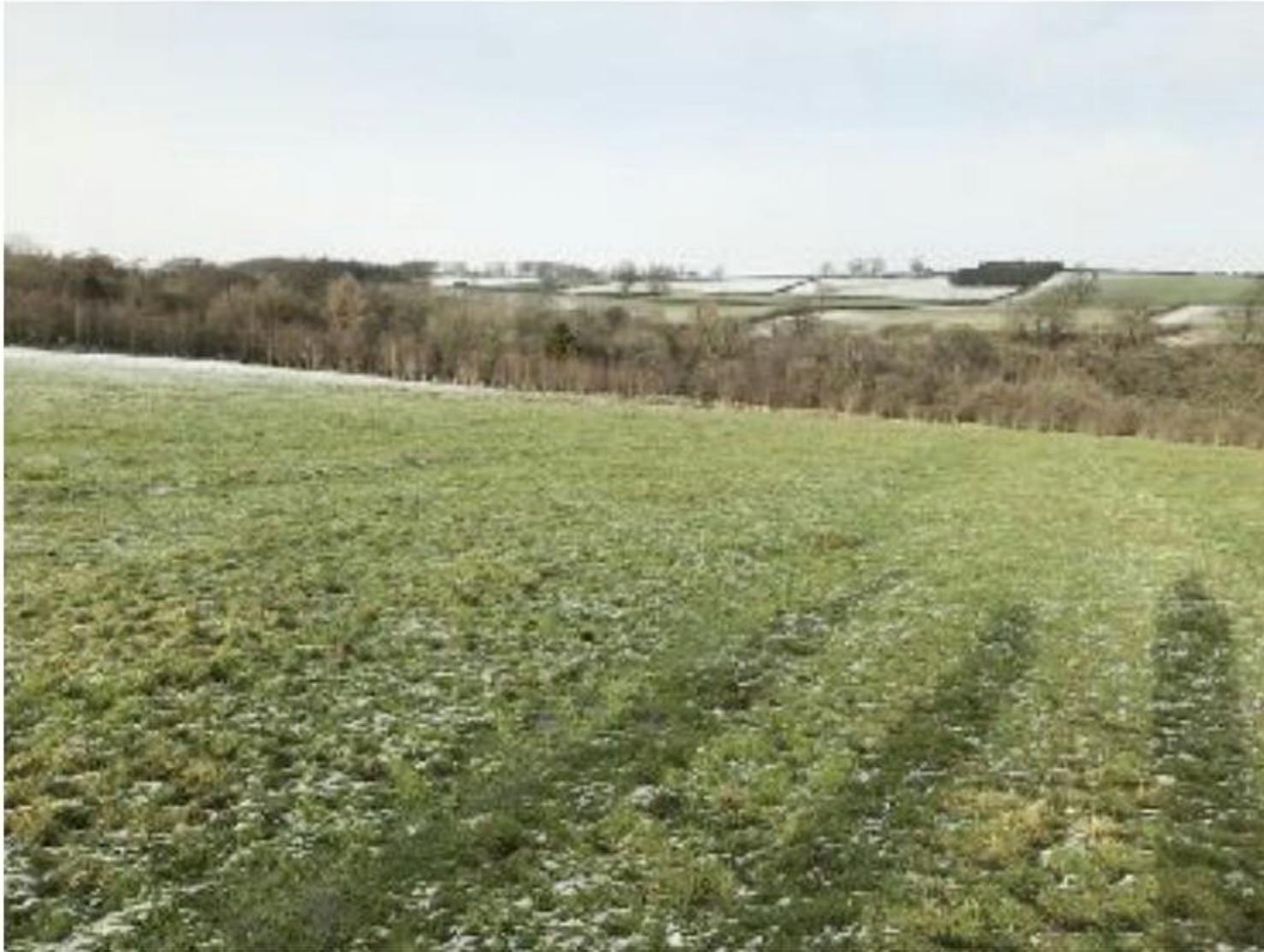
Pond location facing North - North/West

Please insert photo and confirm aspect/direction from which taken: