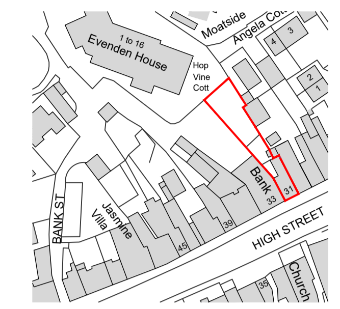
2 Location Plan 1:1250