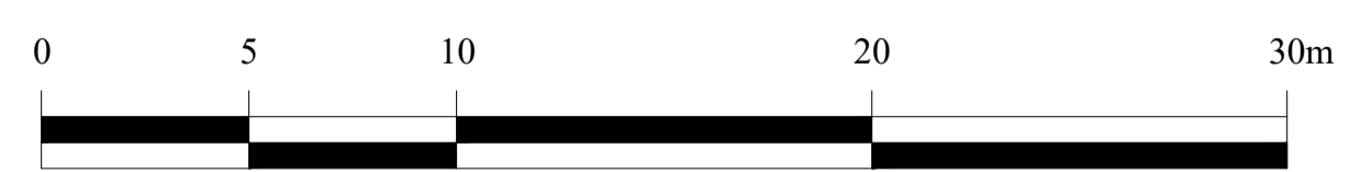
1:200 Scale Bar @ A1