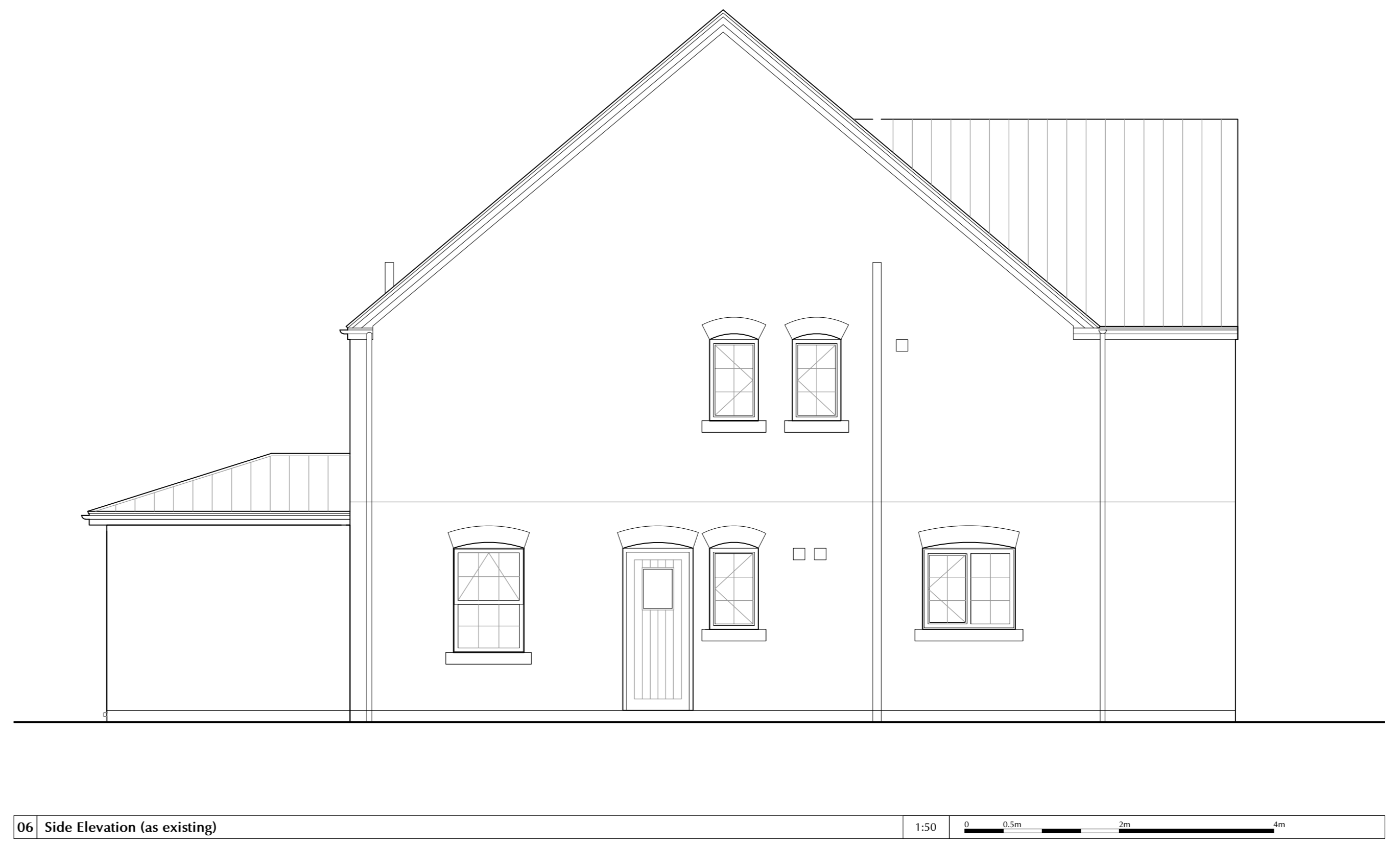
06 | Side Elevation (as existing)

Legal Info 1. ©2024 Rayner Davies Architects. Drawing not for construction. All dimensions are given in millimeters unless otherwise stated. 2. All survey information is the client's responsibility. Check all dimensions on site. Site boundaries are confirmed by survey records with reference to title block. 3. This drawing is intended for use by the commissioning client only. RDA do not accept any liability in any third party for the information herein.