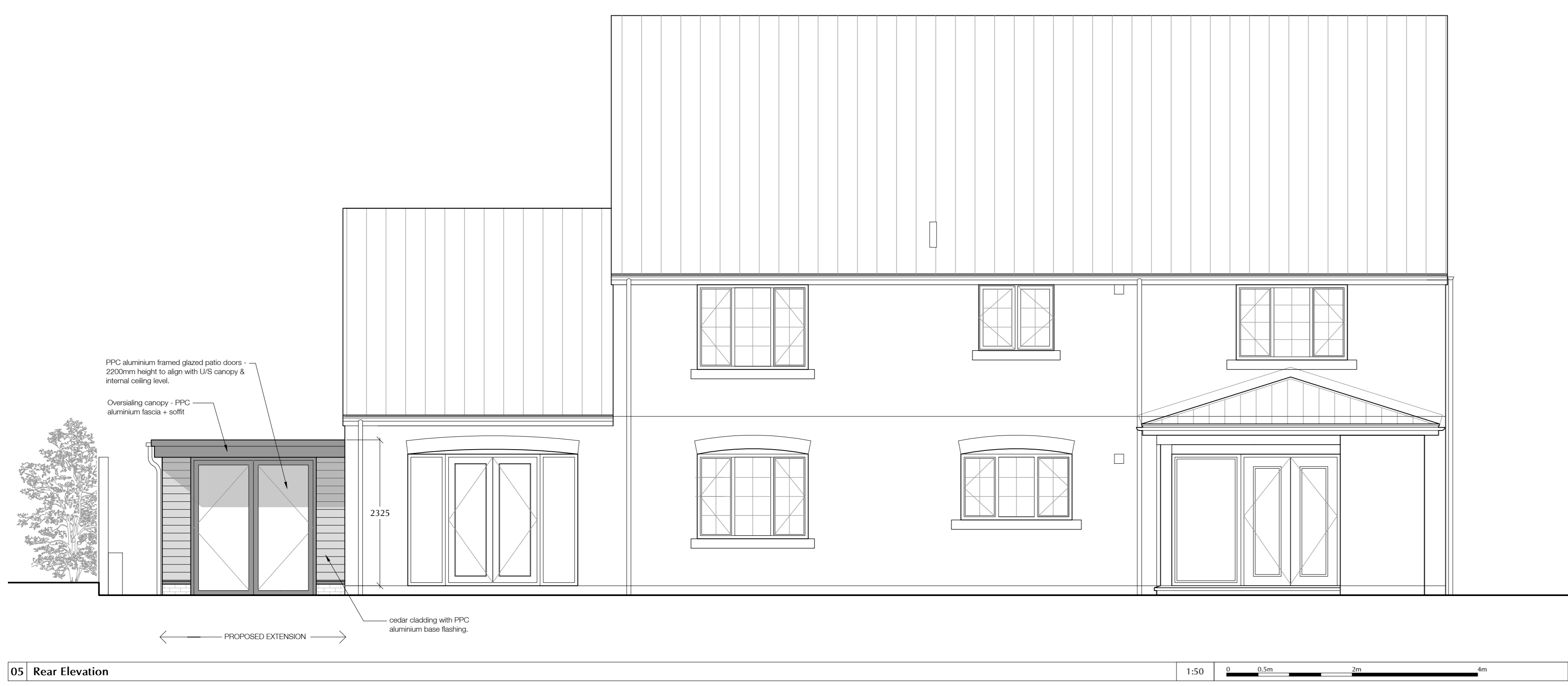
05 | Rear Elevation