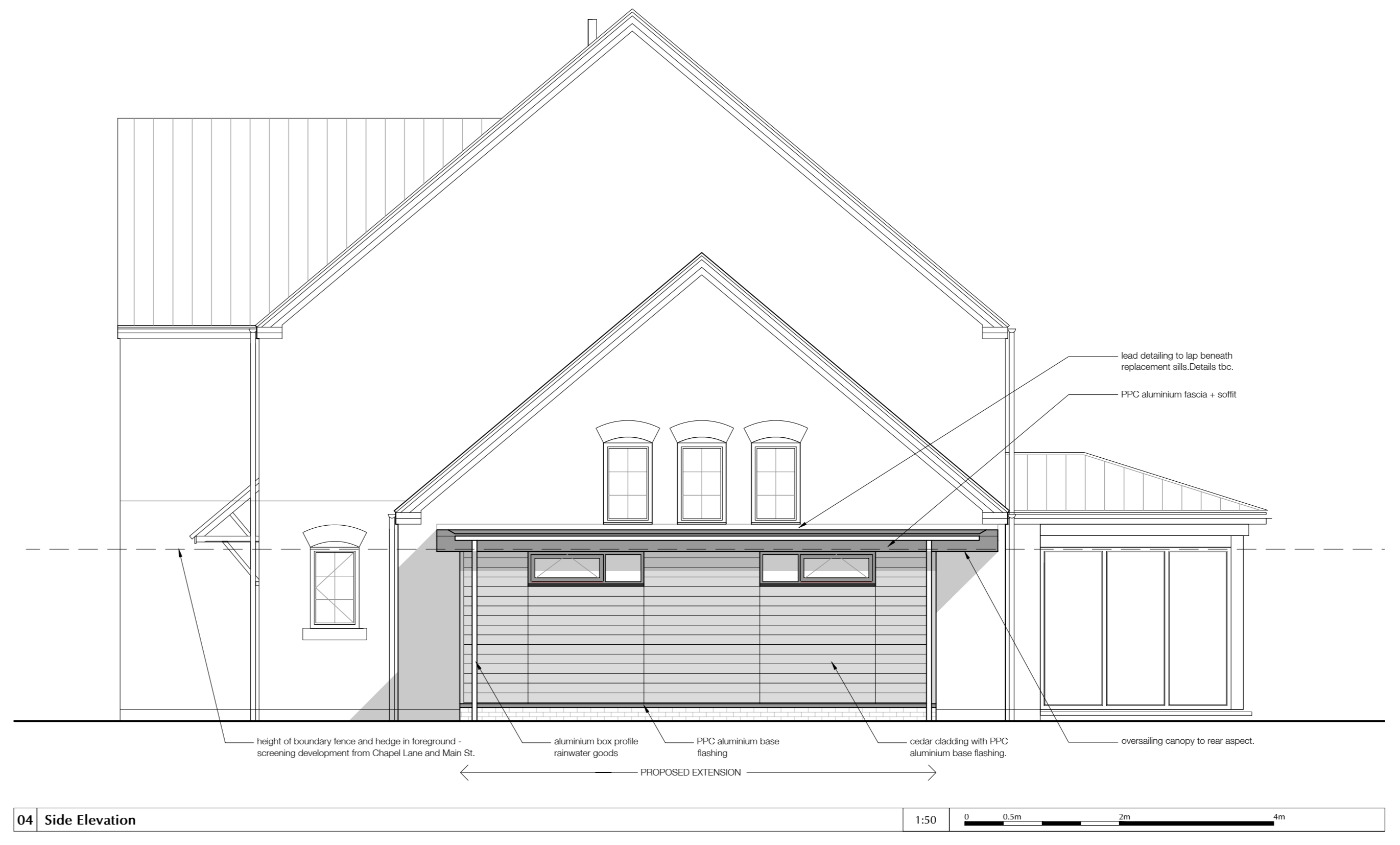
04 | Side Elevation