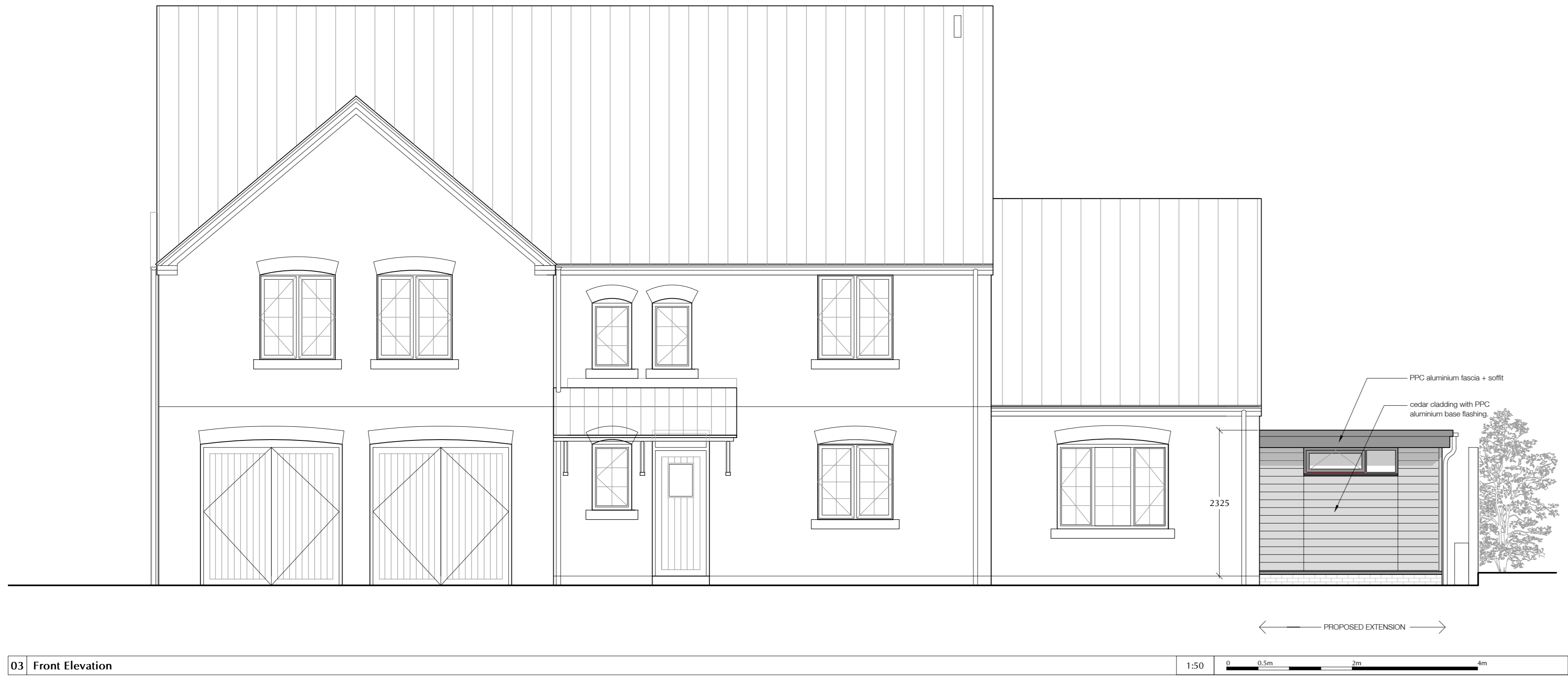
03 | Front Elevation