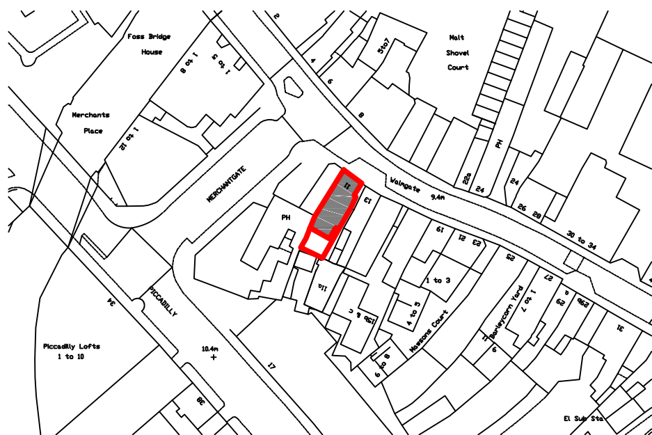
LOCATION PLAN 1:1250 @ A3