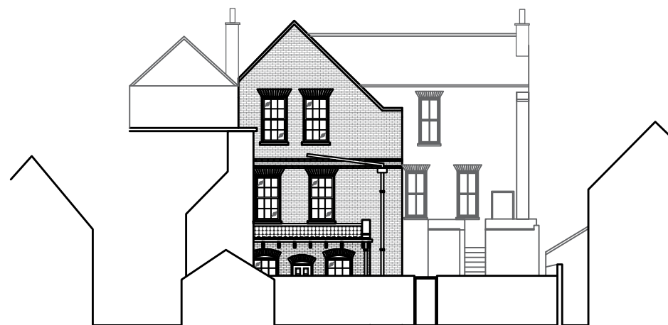
REAR ELEVATION 1:200 @ A3