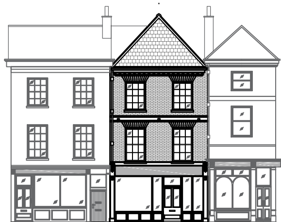
FRONT ELEVATION 1:200 @ A3

Re-decorate all external joinery and piece-in/replace where beyond repair to include for new putties to all windows