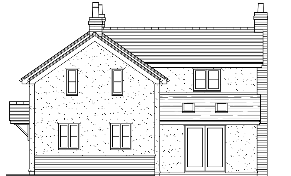
Proposed Side Elevation - 1:100