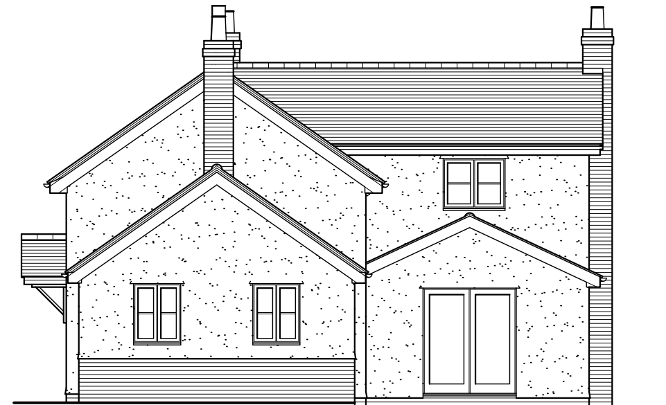
Existing Side Elevation - 1:100