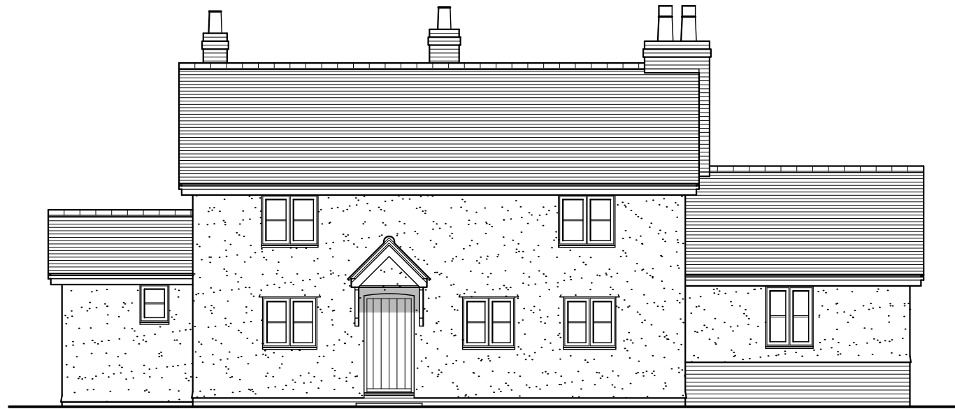
Existing Front Elevation - 1:100