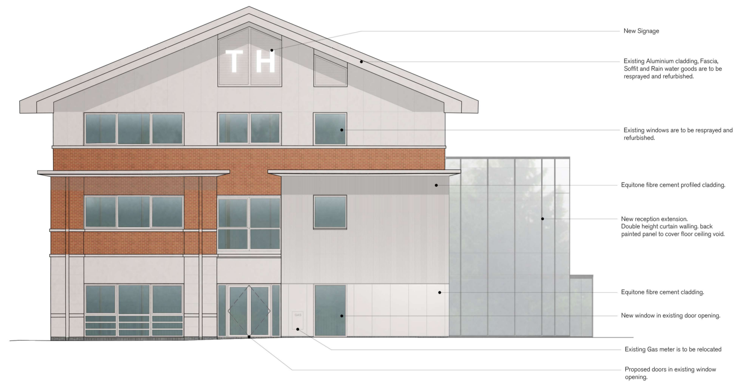
PROPOSED EAST ELEVATION - C 1:100