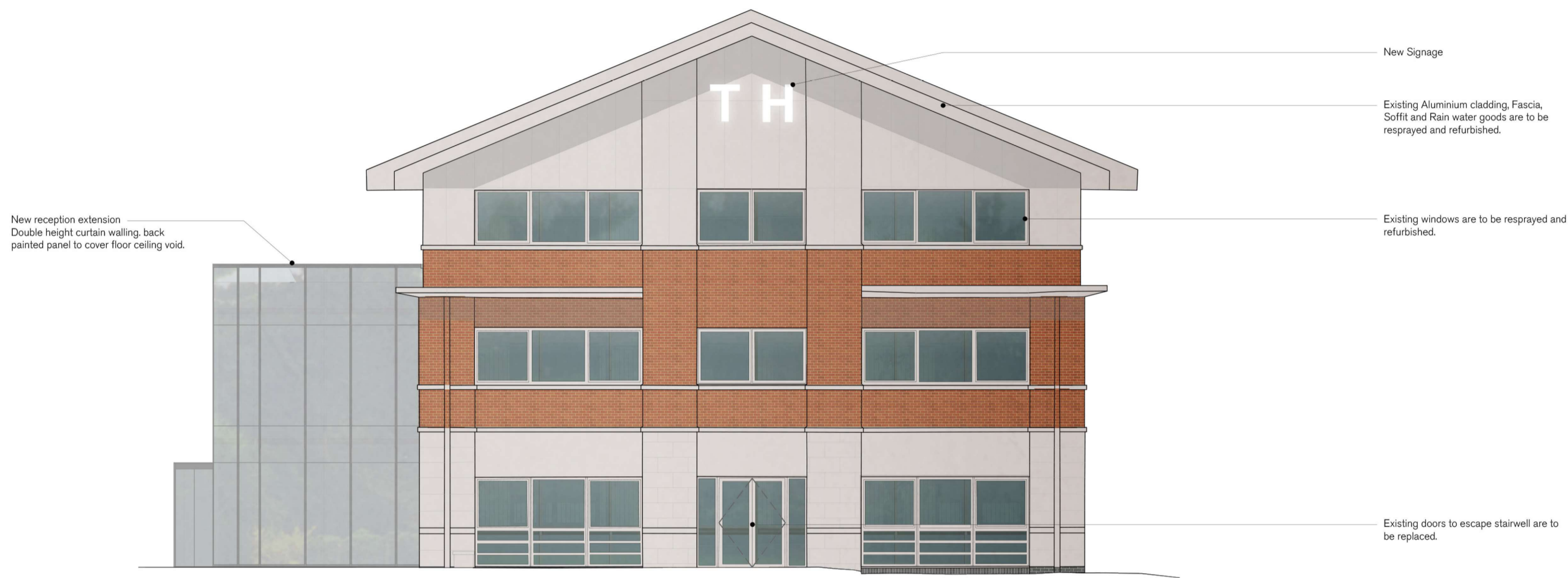
PROPOSED WEST ELEVATION - A 1:100