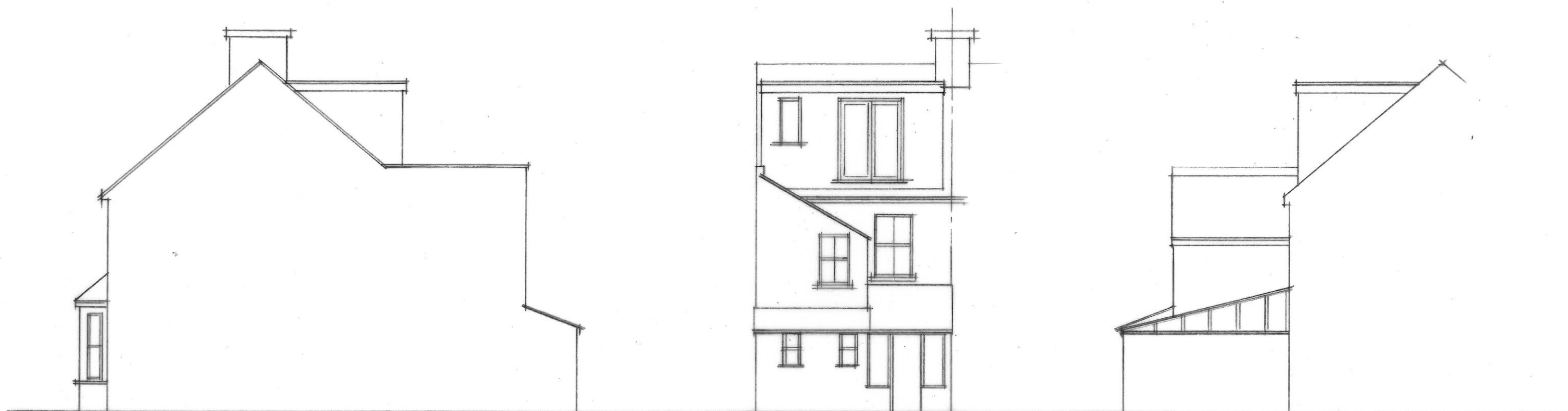
side existing elevations