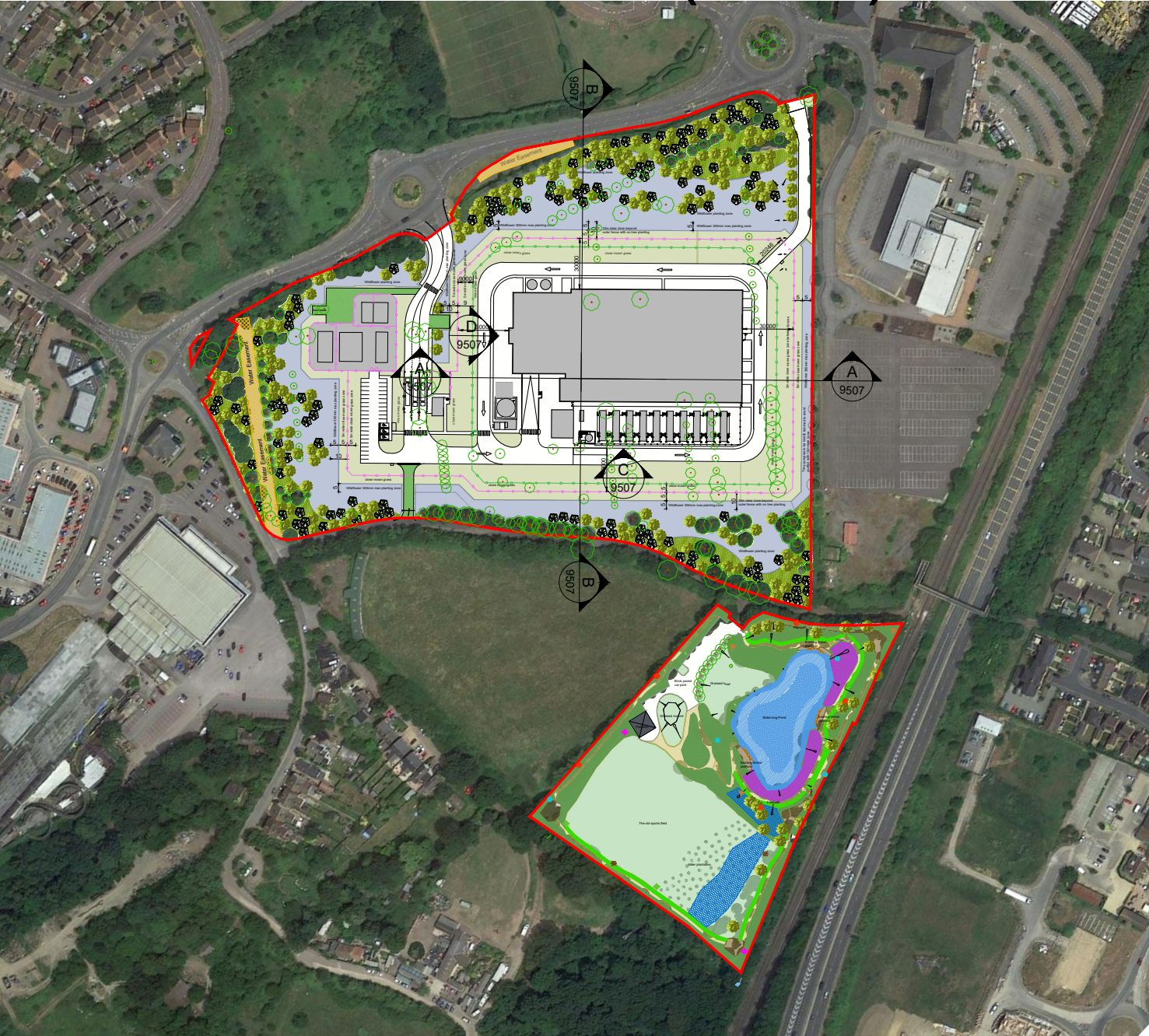
Section Locations (NTS)