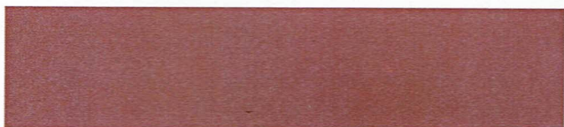
Carnelia RAL 3009