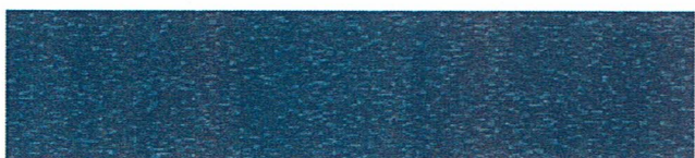
Opal KC 400