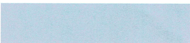
Topaz KC 200