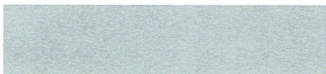
Obsidian RAL 9007