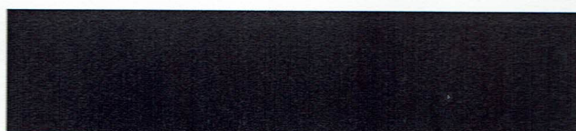
Jet RAL 9005