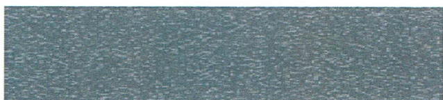
Greyrock KC 100