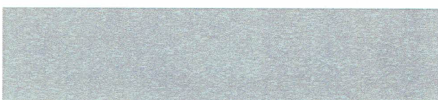
Graphite RAL 9023