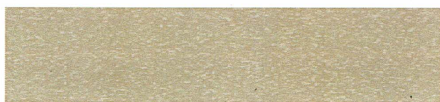
Beigestone RAL 1035