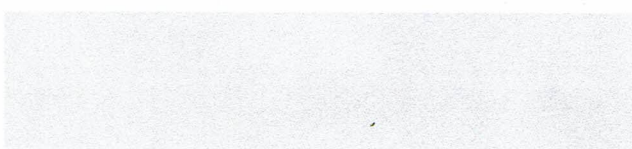
Silver RAL 9006