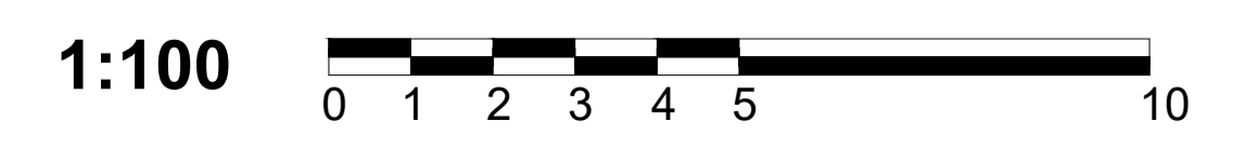
Site plan as existing 1:100