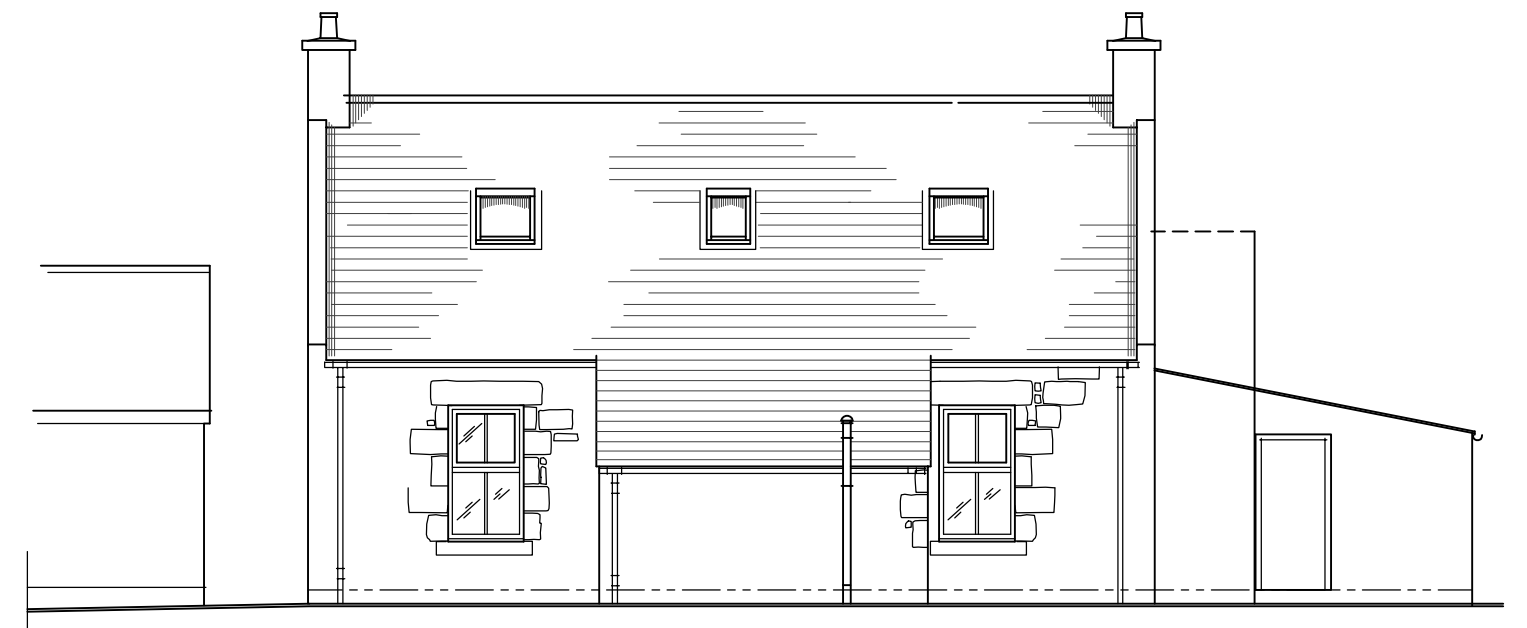
North Elevation :