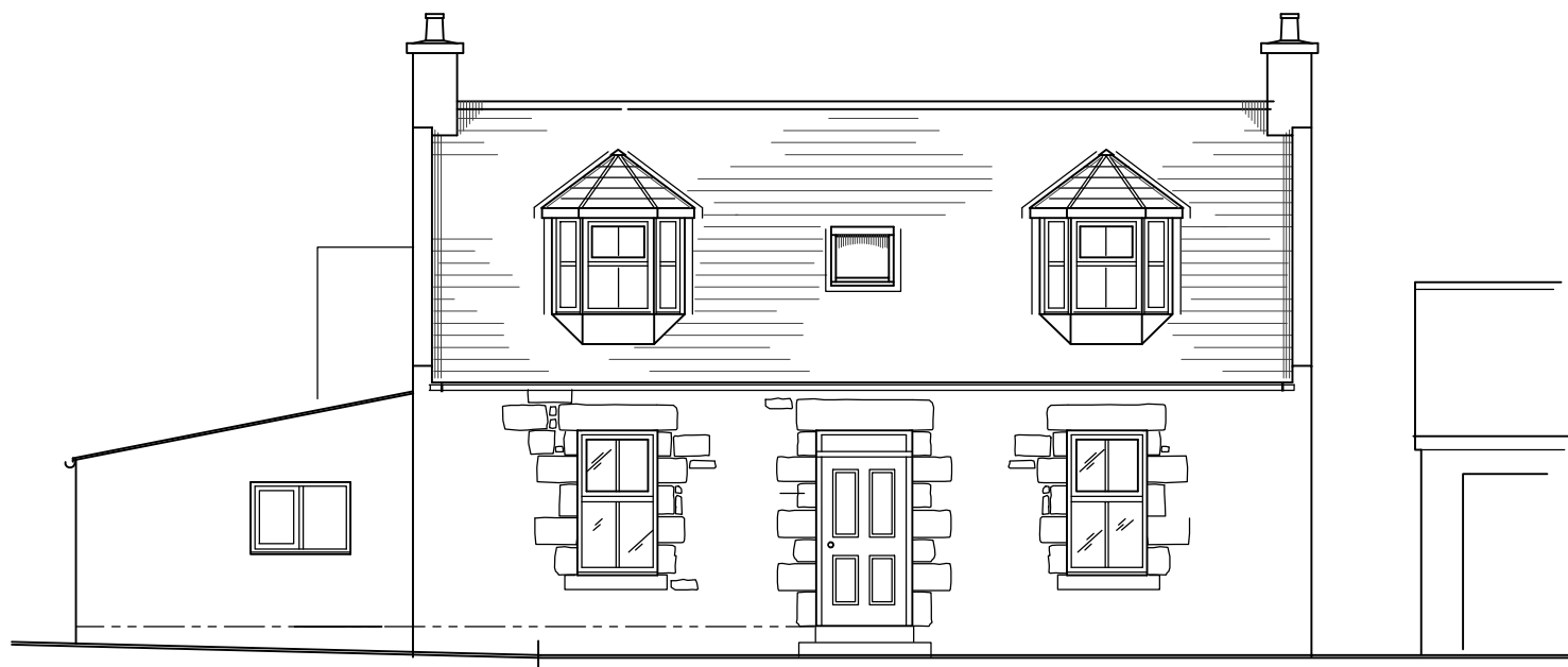
South Elevation : Scale 1:100