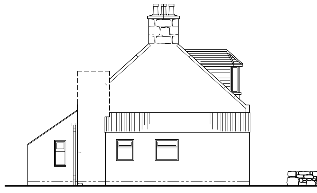
West Elevation :