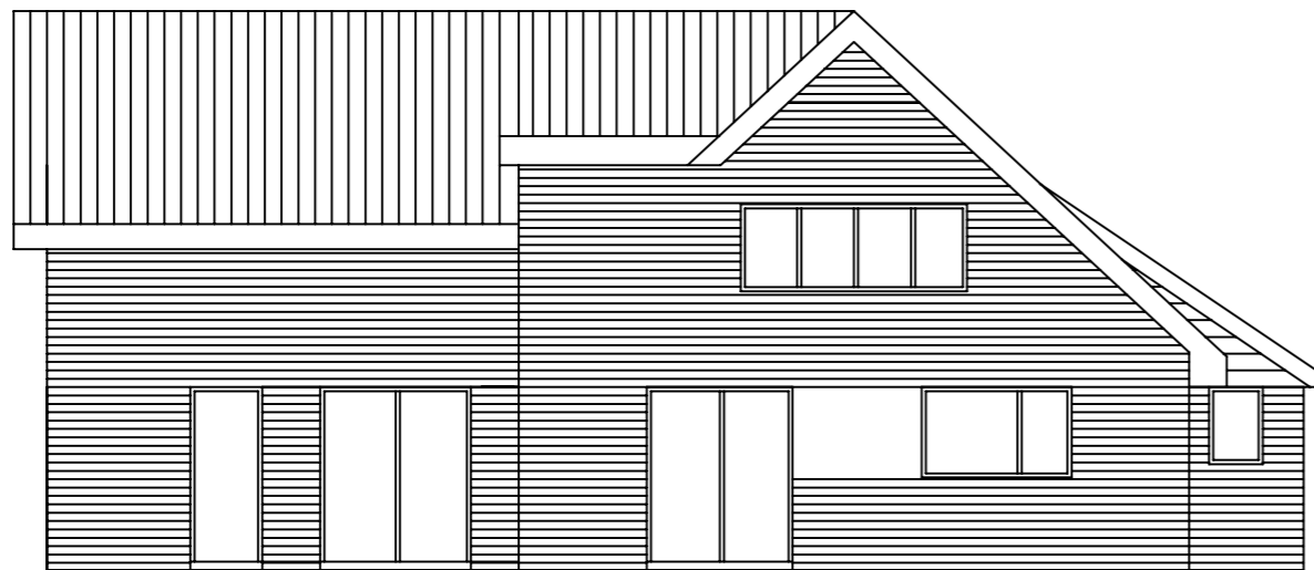
Proposed North East (Rear) Elevation