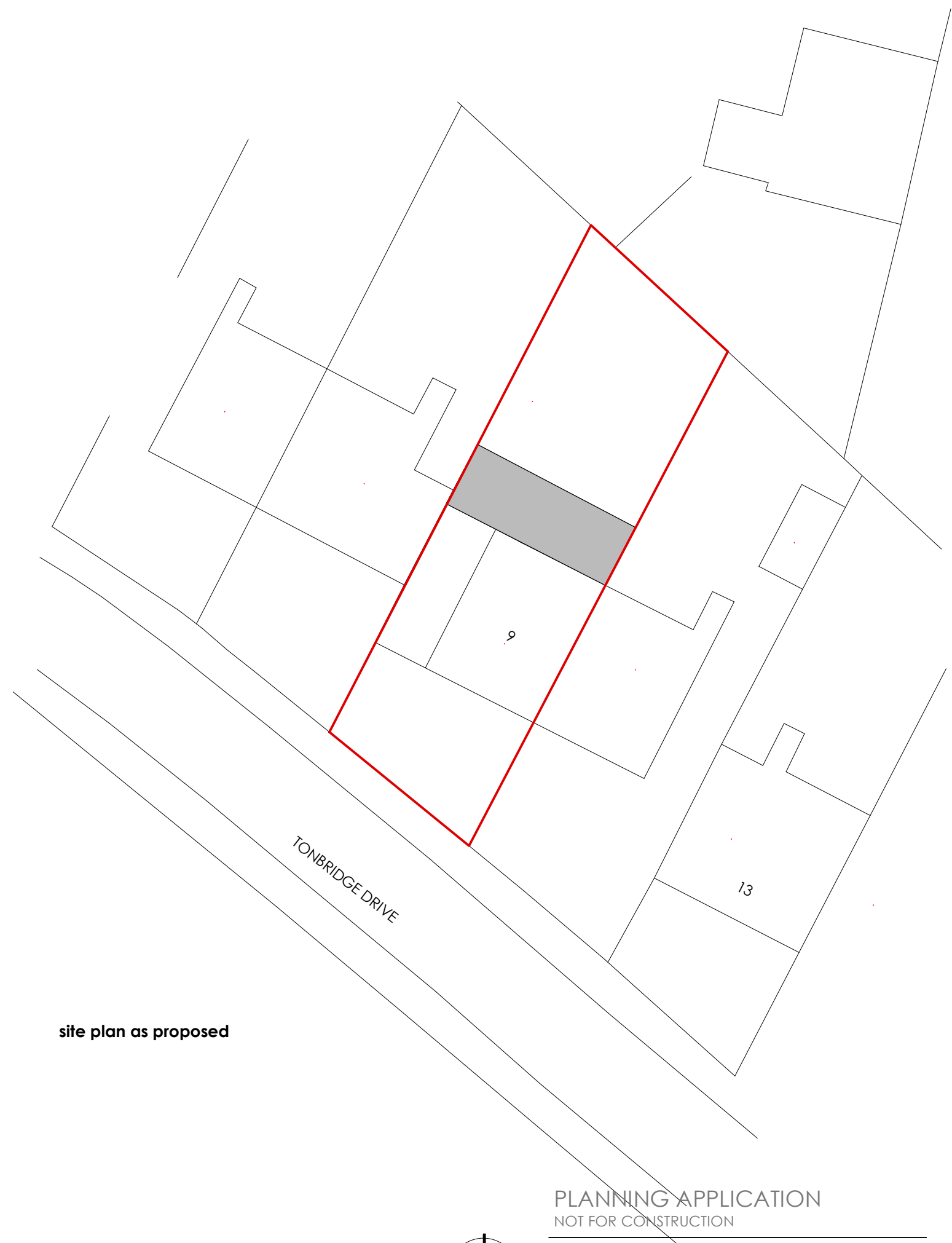
site plan as proposed