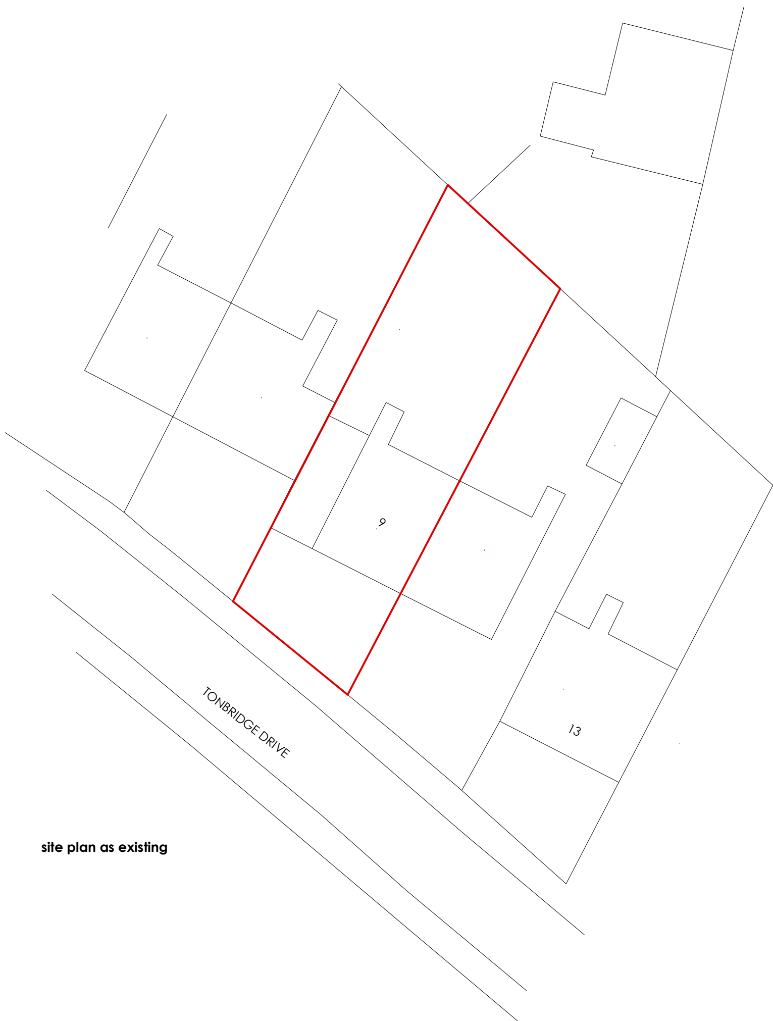
site plan as existing