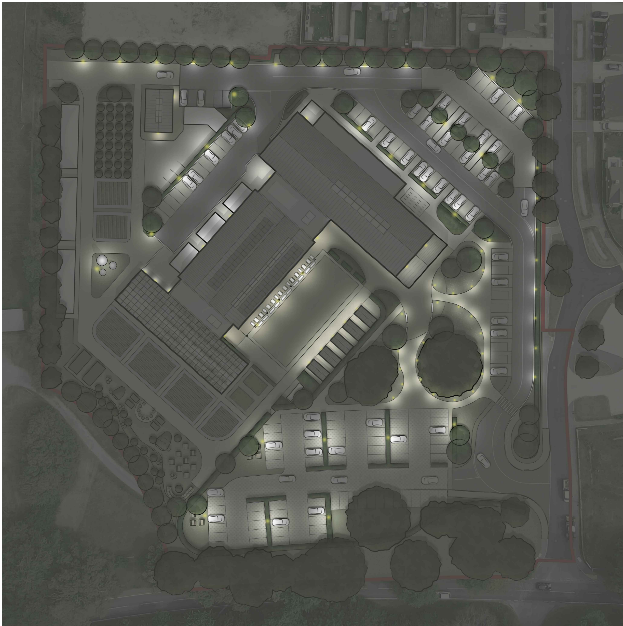
01 013 OUTLINE LIGHTING PLAN VISUALISATION NTS