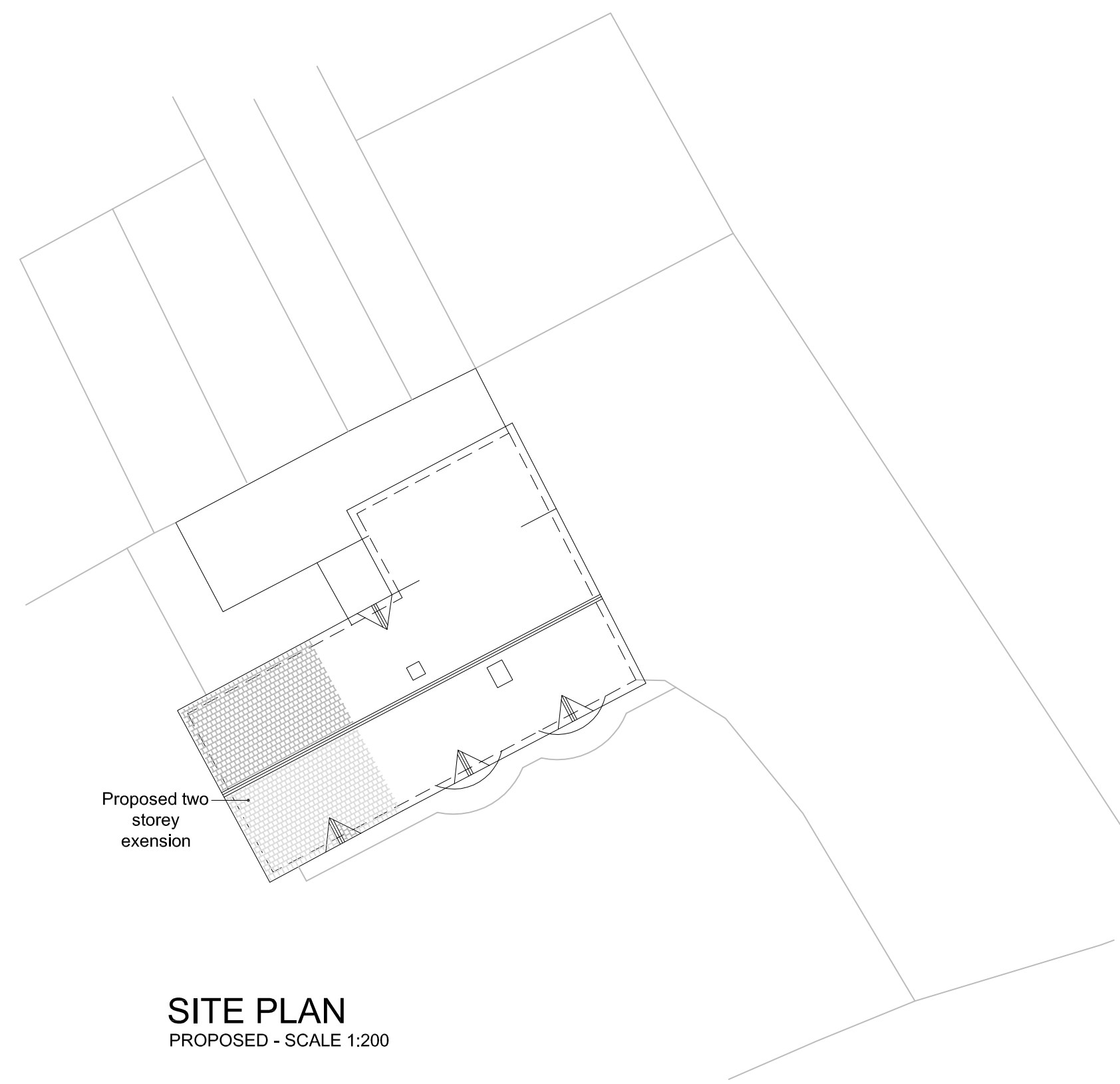
SITE PLAN PROPOSED - SCALE 1:200