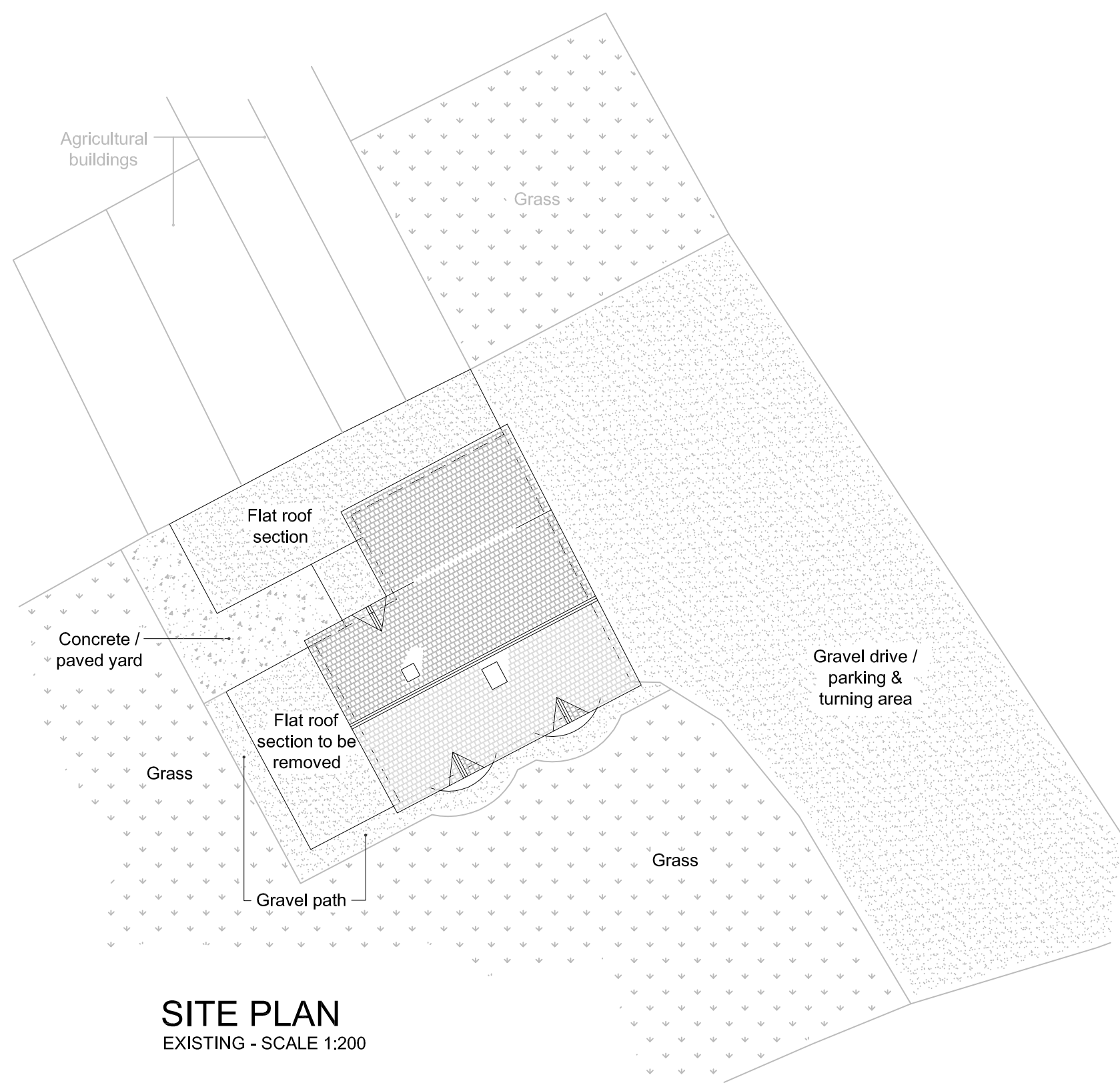
SITE PLAN EXISTING - SCALE 1:200