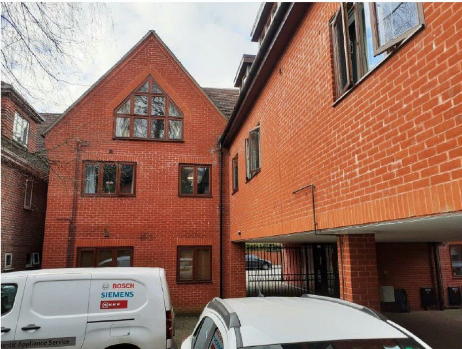
Rear left (& left side of outrigger)