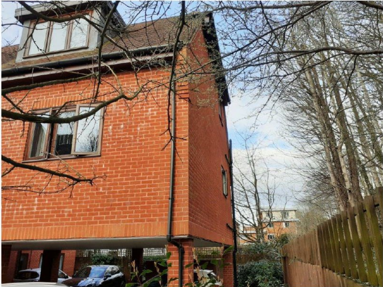
Rear and left side of outrigger