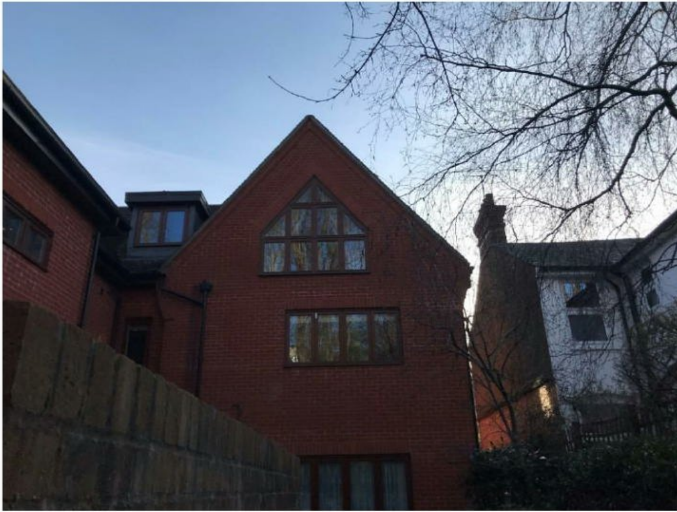
Rear elevation (right) showing neighbouring property at rear