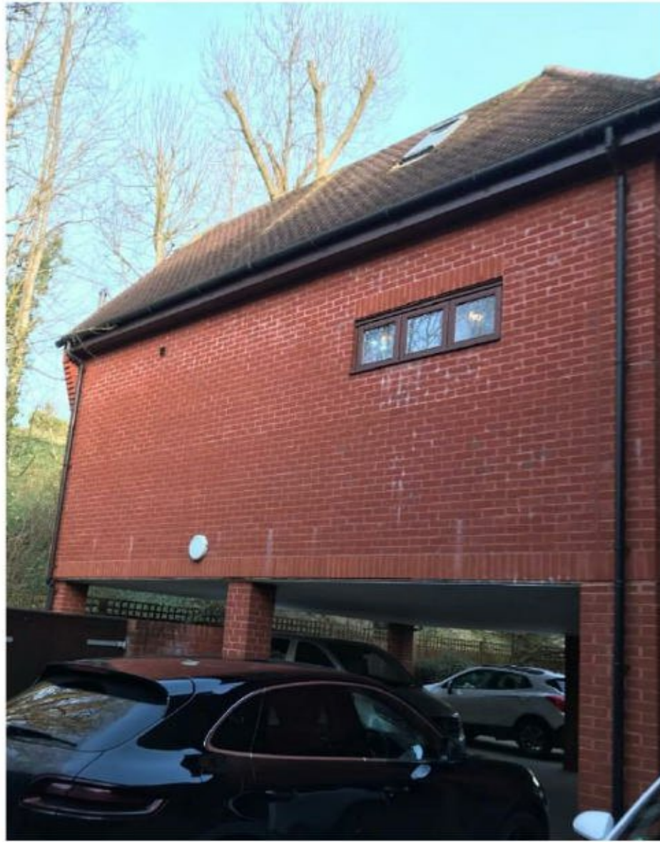
Side elevation-outrigger (showing existing roof light)