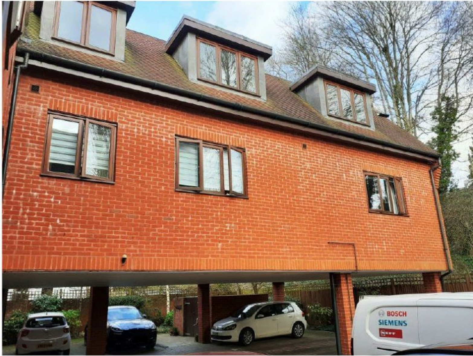
Left side of outrigger (as shown in photo above) Flat 9 dormer windows at top