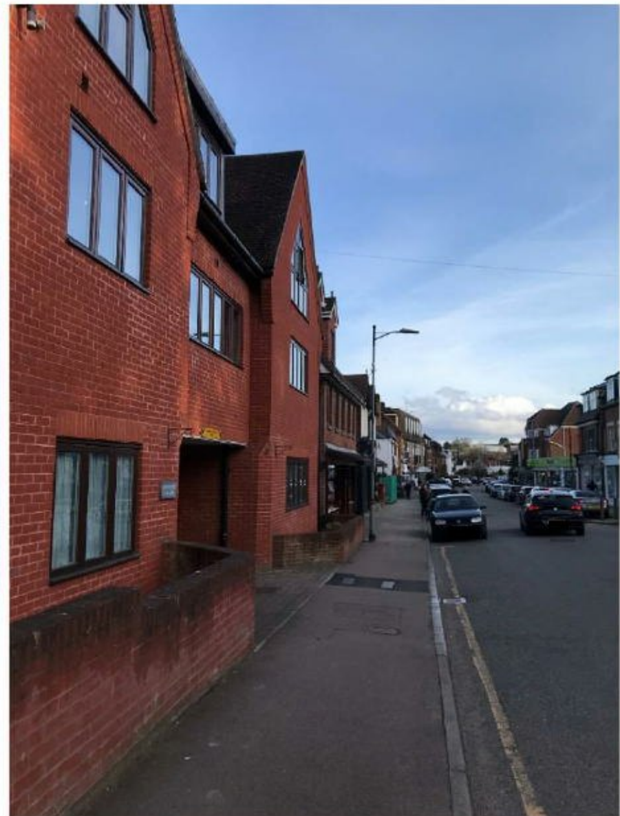
Front street view to the right