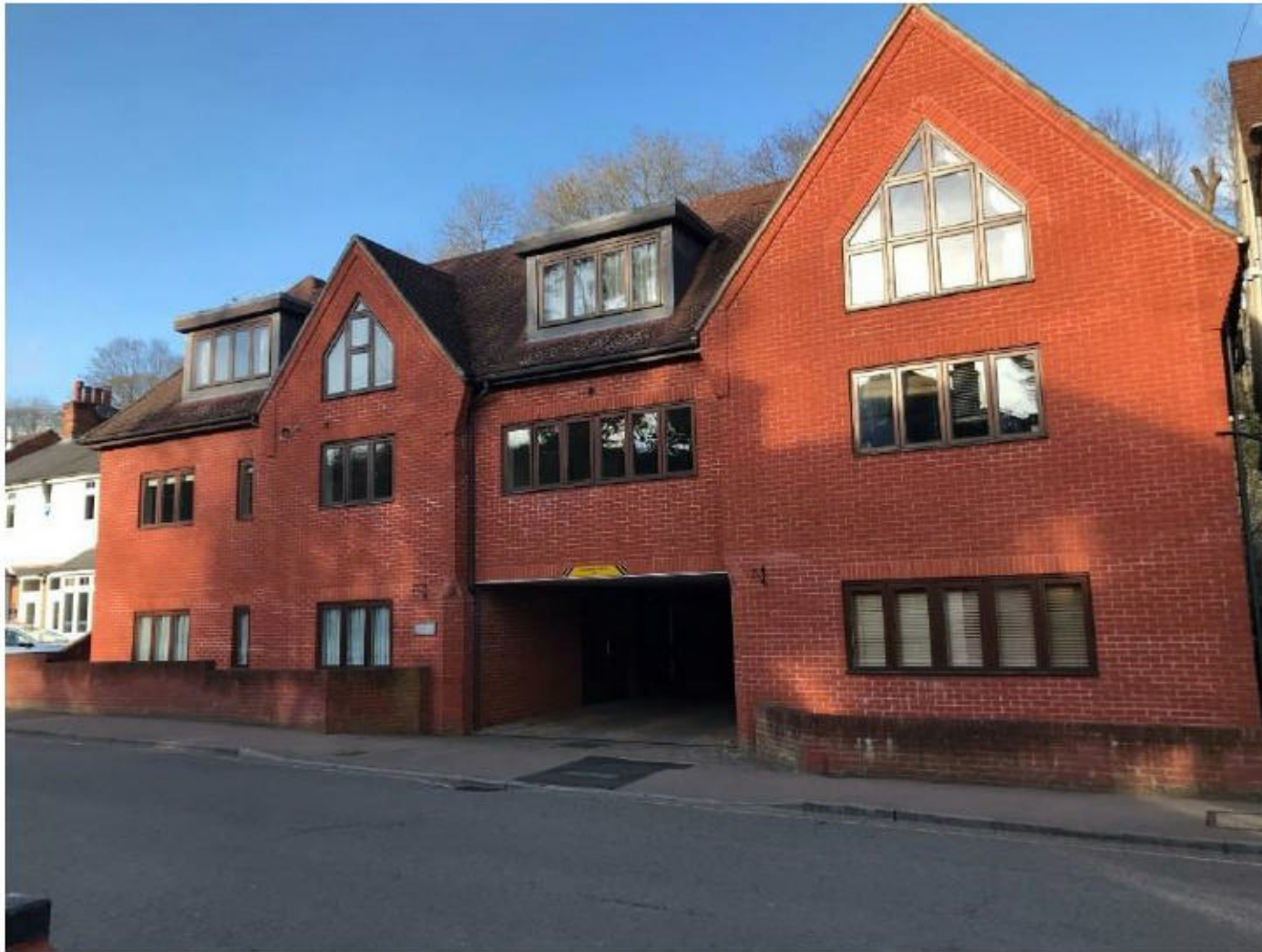
Front elevation/Street view of flats (No 9 to rear so not visible from street)