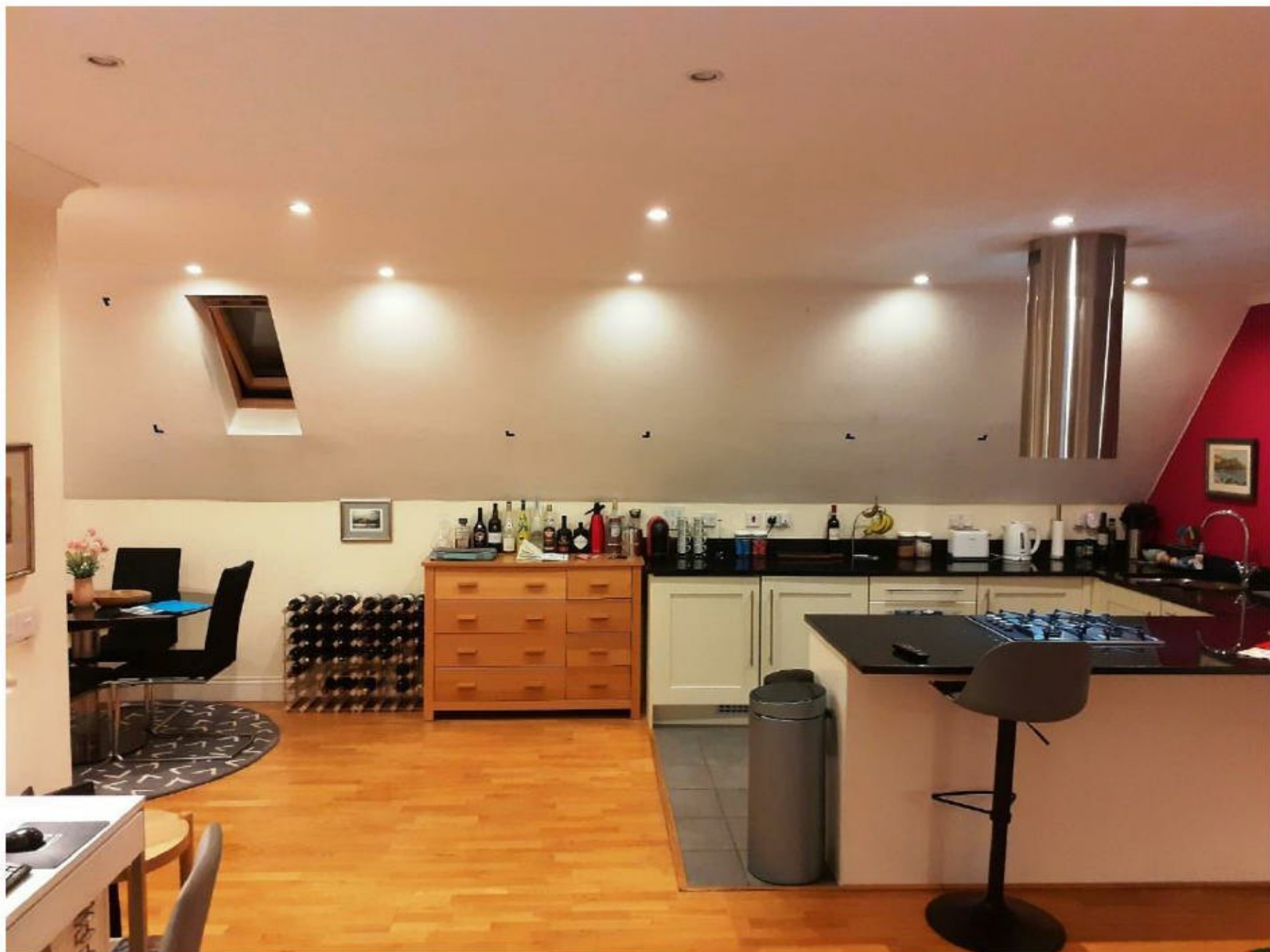
Flat 9 - Internal photograph showing existing roof light and marked location of proposed roof lights