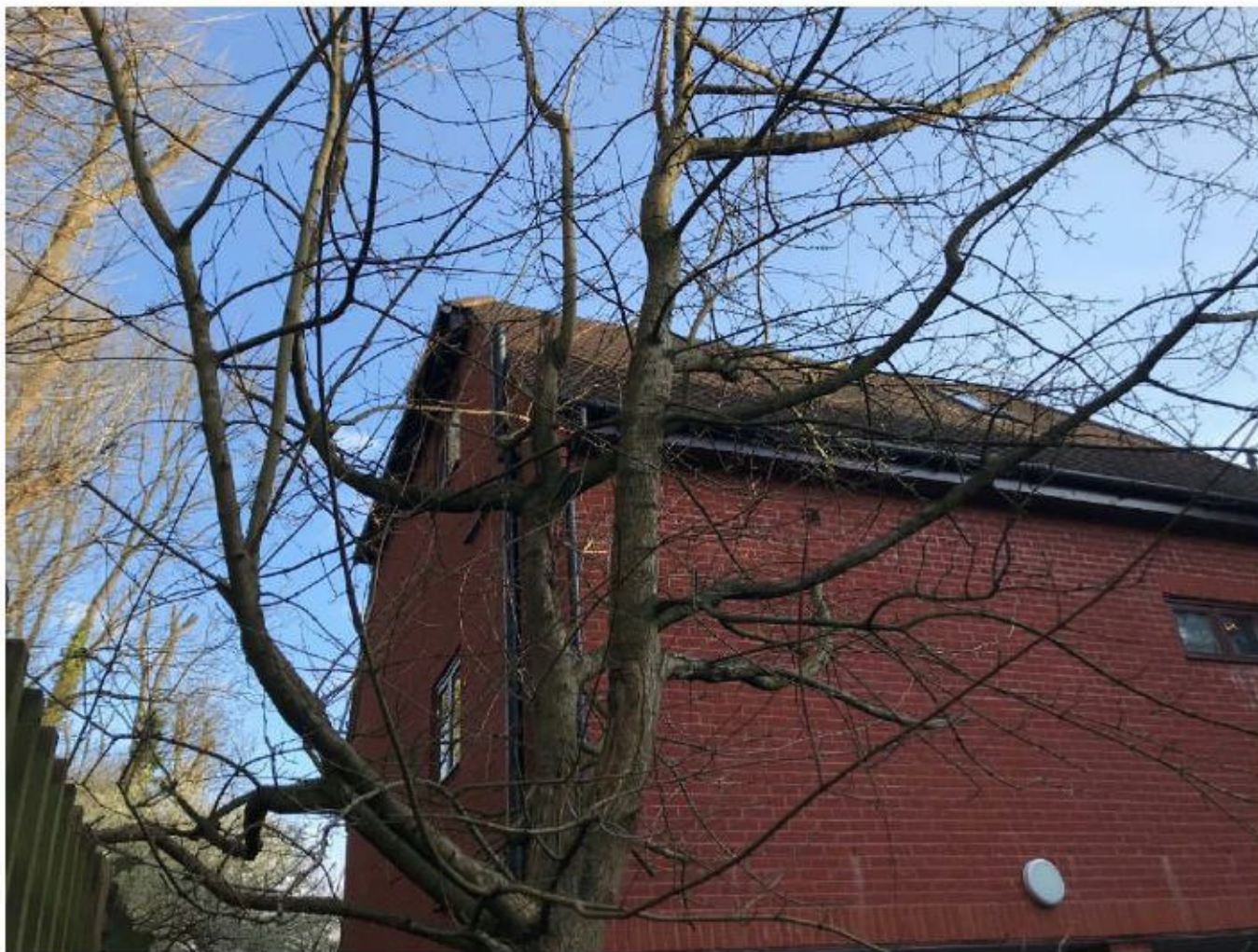
Right side of outrigger & rear elevation (showing existing roof light in Flat 9)