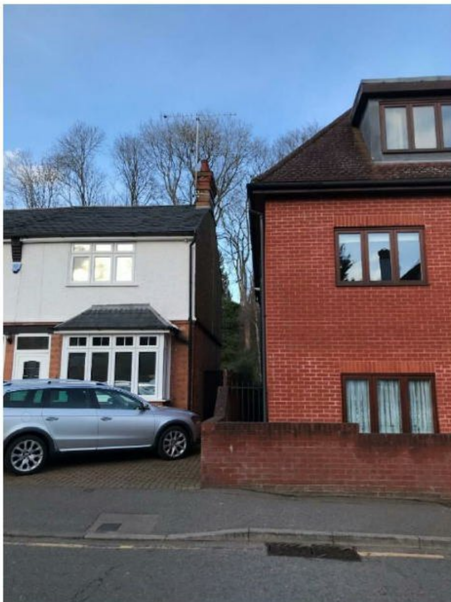
Front street view to the left