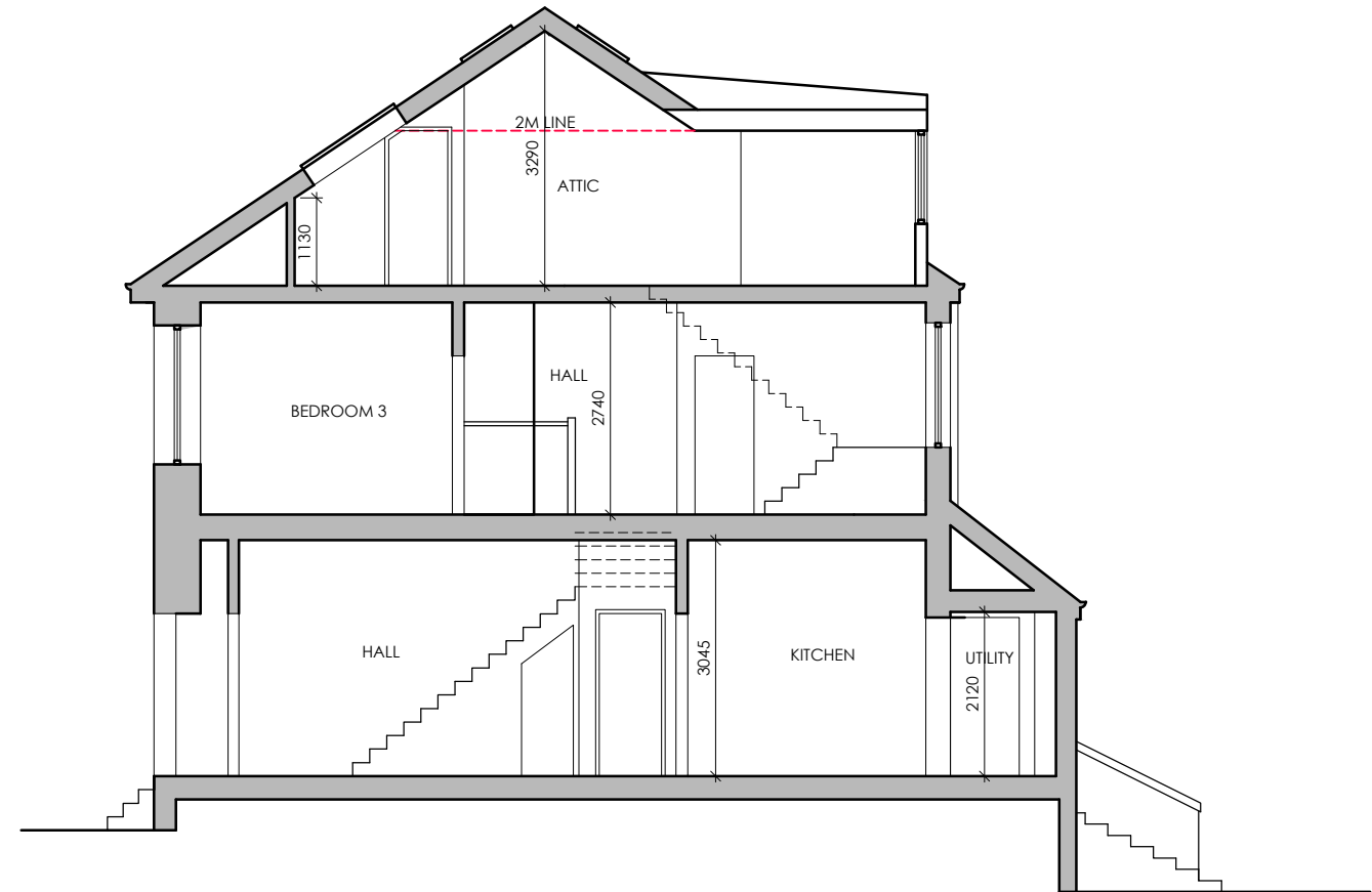
EXISTING SECTION B-B