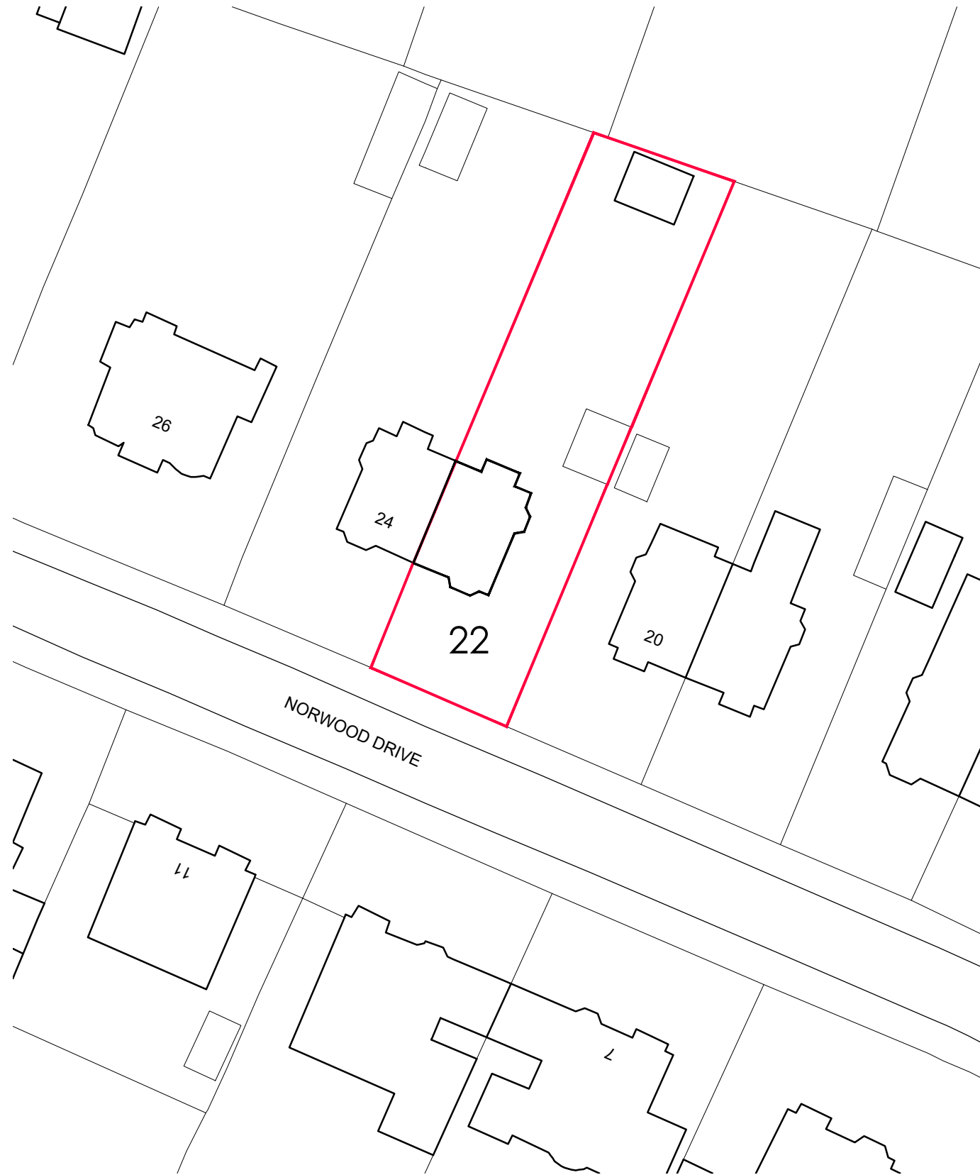
BLOCK PLAN AS EXISTING