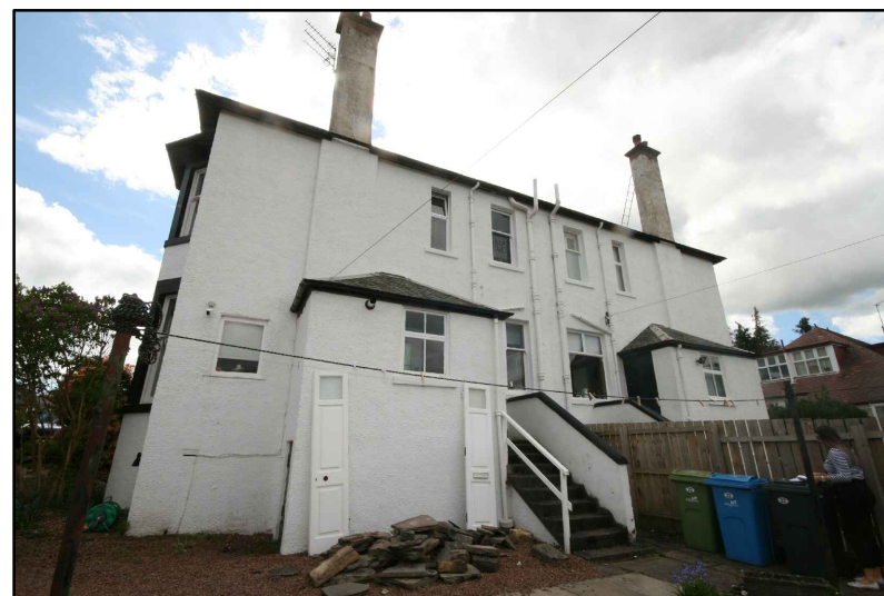
PHOTOGRAPH OF REAR ELEVATION