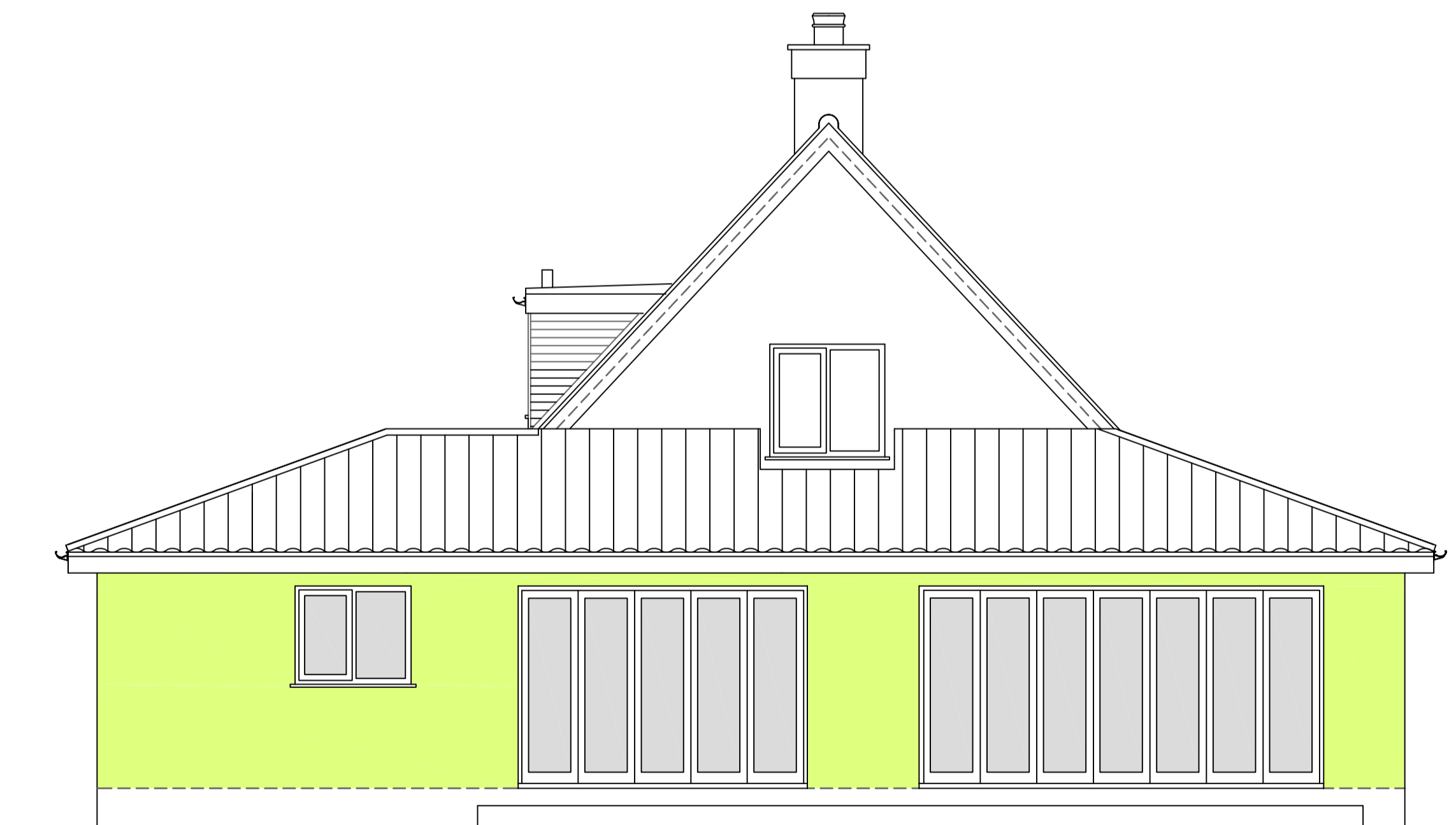
WEST ELEVATION AS PROPOSED