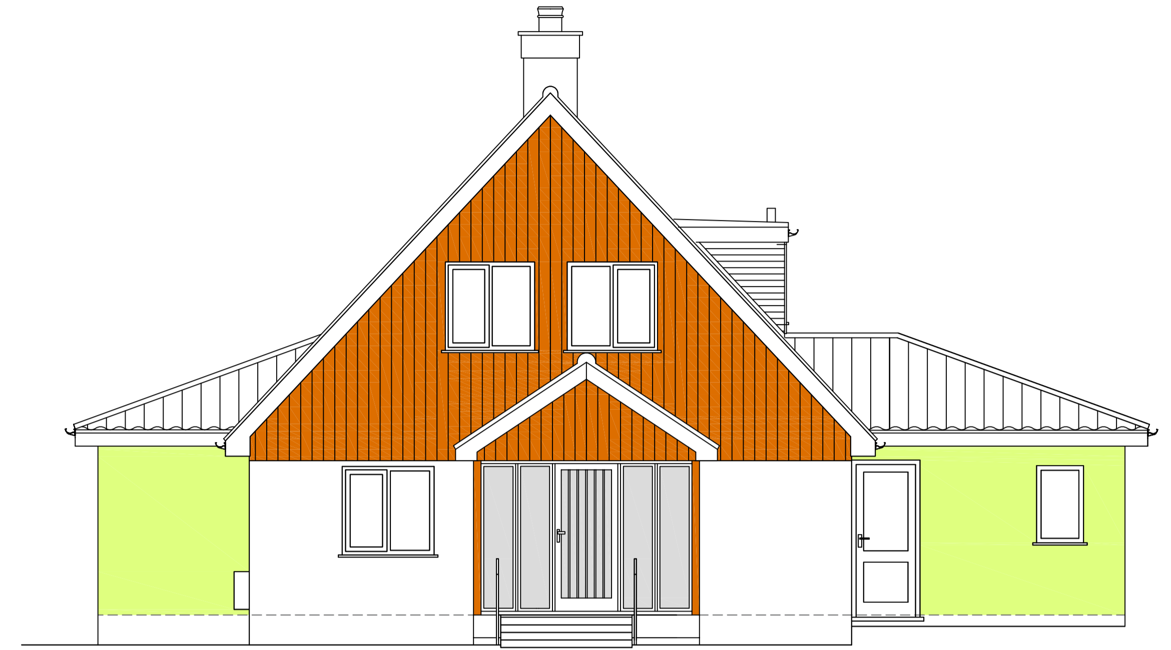
EAST ELEVATION AS PROPOSED