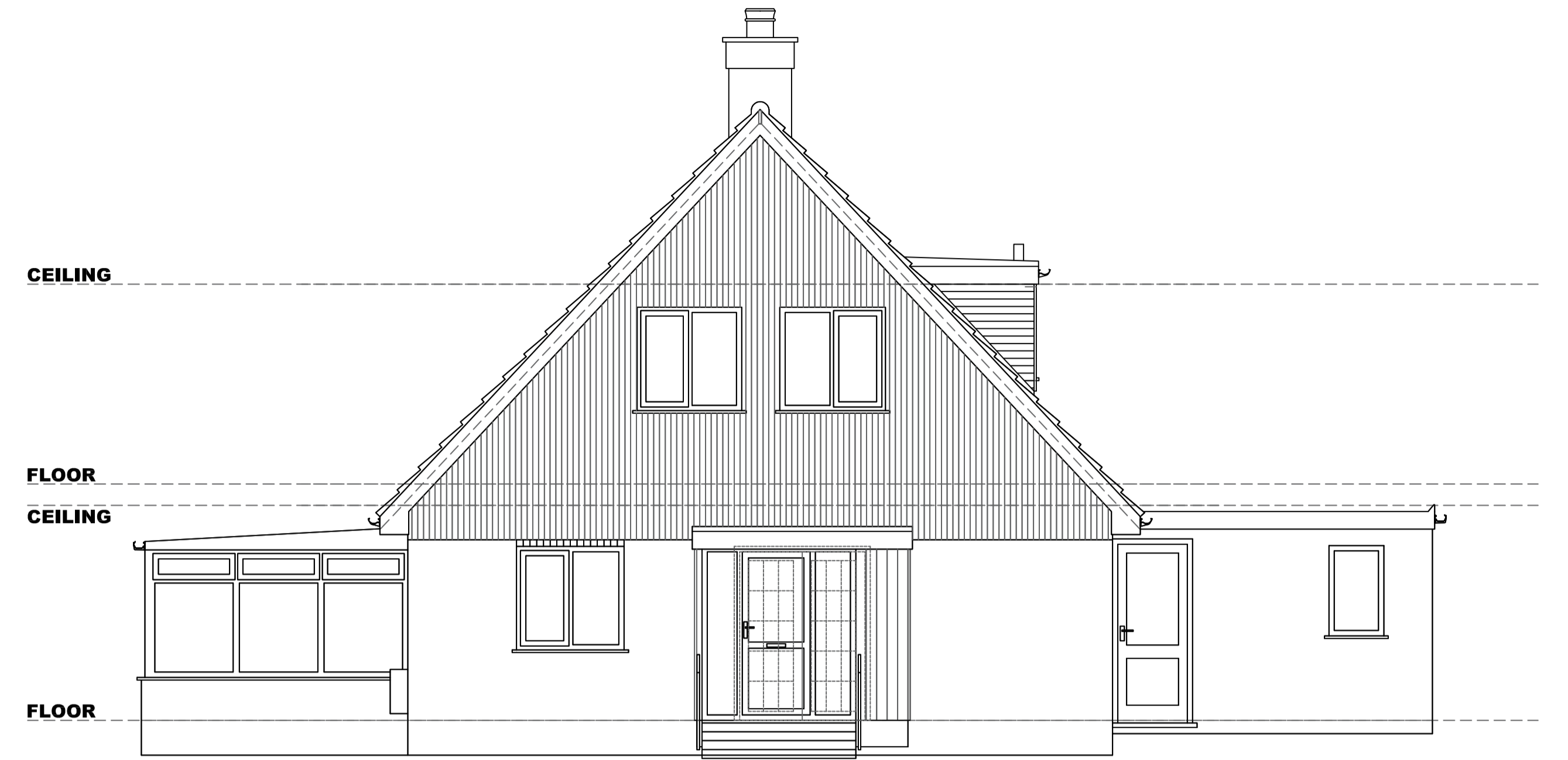
EAST ELEVATION AS EXISTING