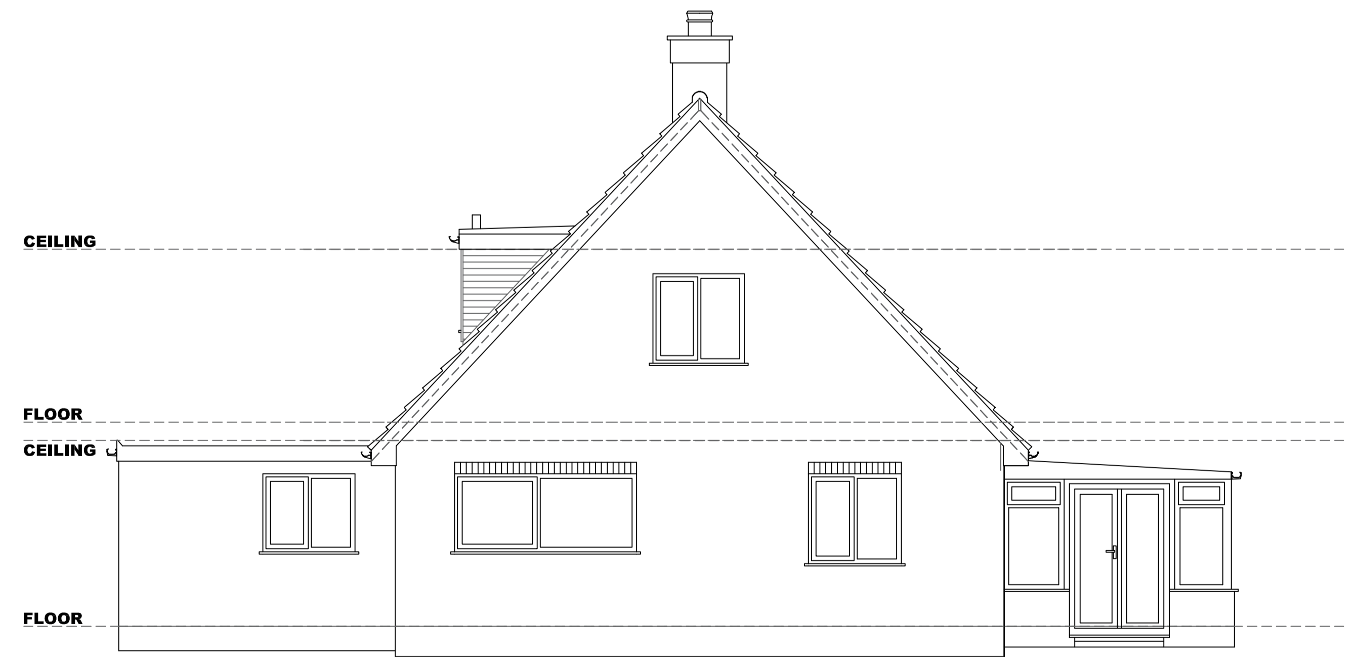
WEST ELEVATION AS EXISTING