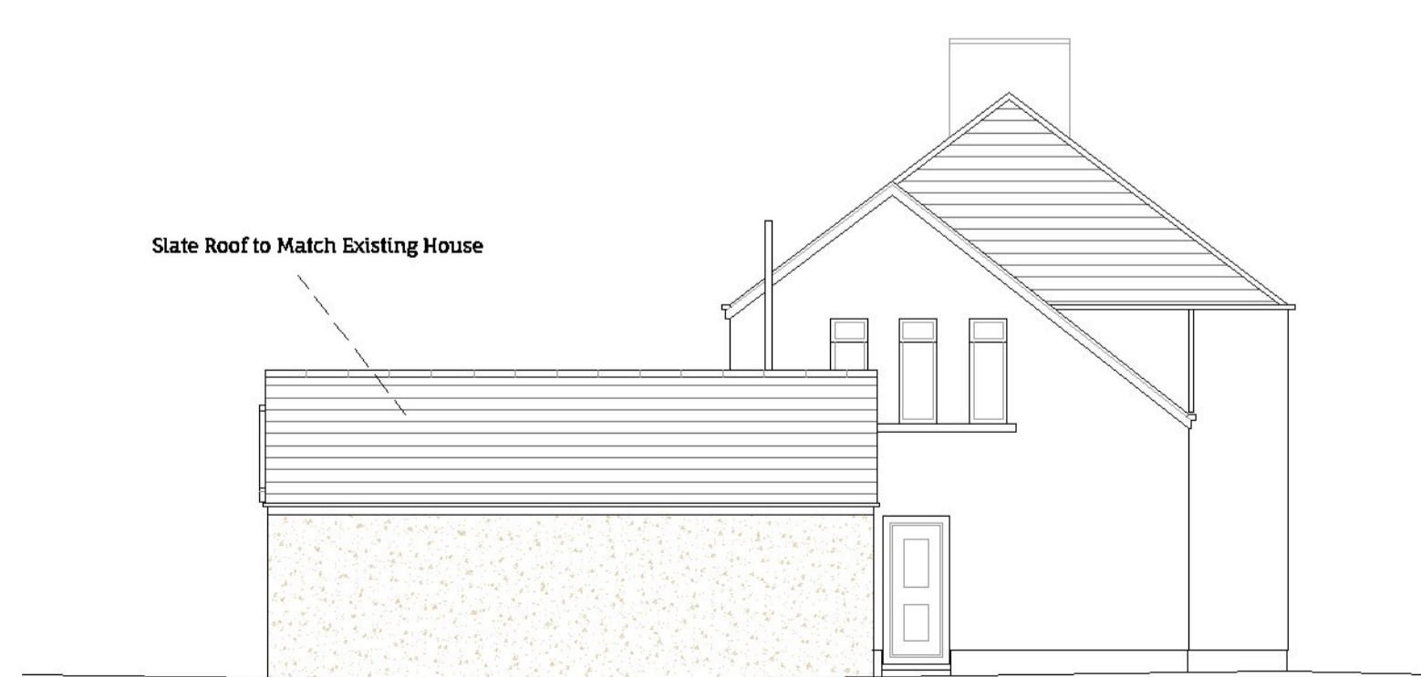
Proposed South Elevation 1:100