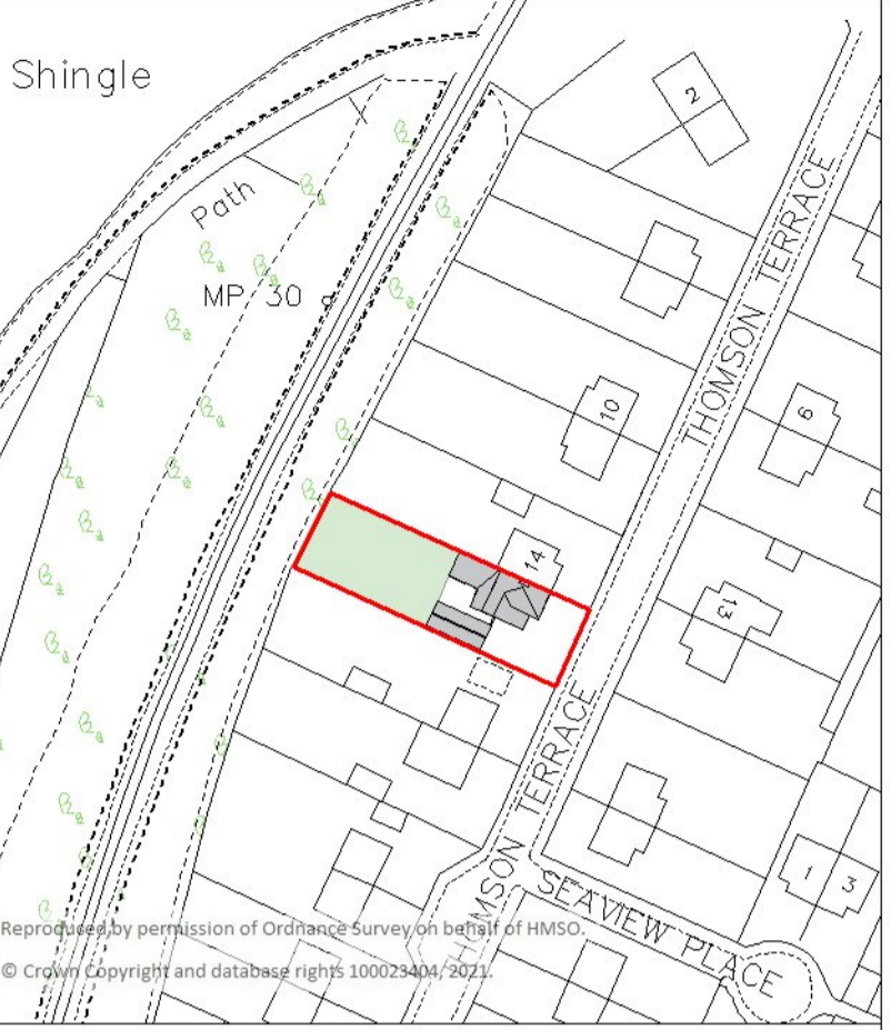
Proposed Location Plan 11250

This drawing is solely for the purposes of obtaining Planning Approval. The drawing may be suitable for constructional purposes but it may be necessary to augment and/or amend this information. No liability will be accepted for any omission should the drawing be used for constructional purposes. Do not scale this drawing for construction purposes.