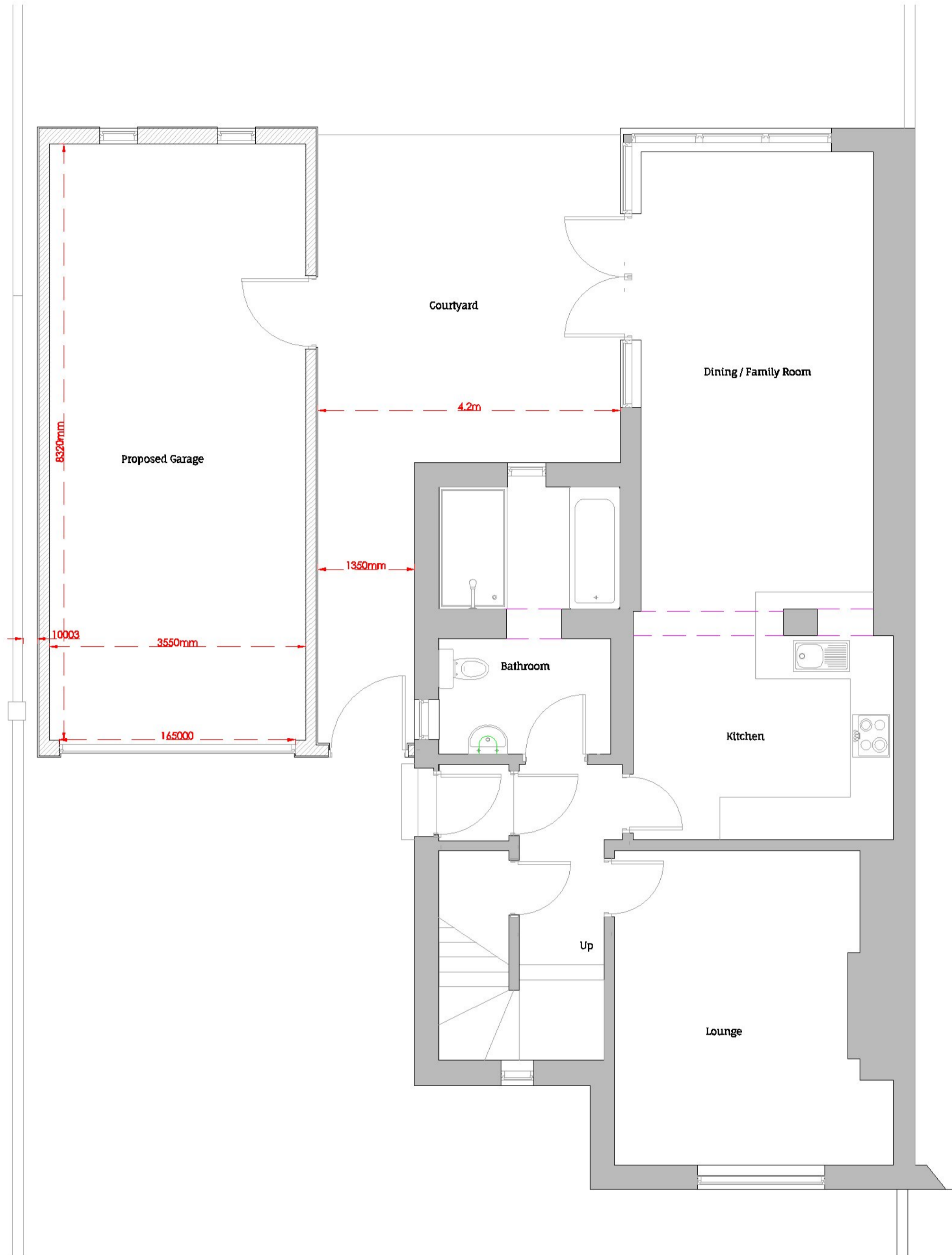
Proposed Ground Floor Plan 1:50