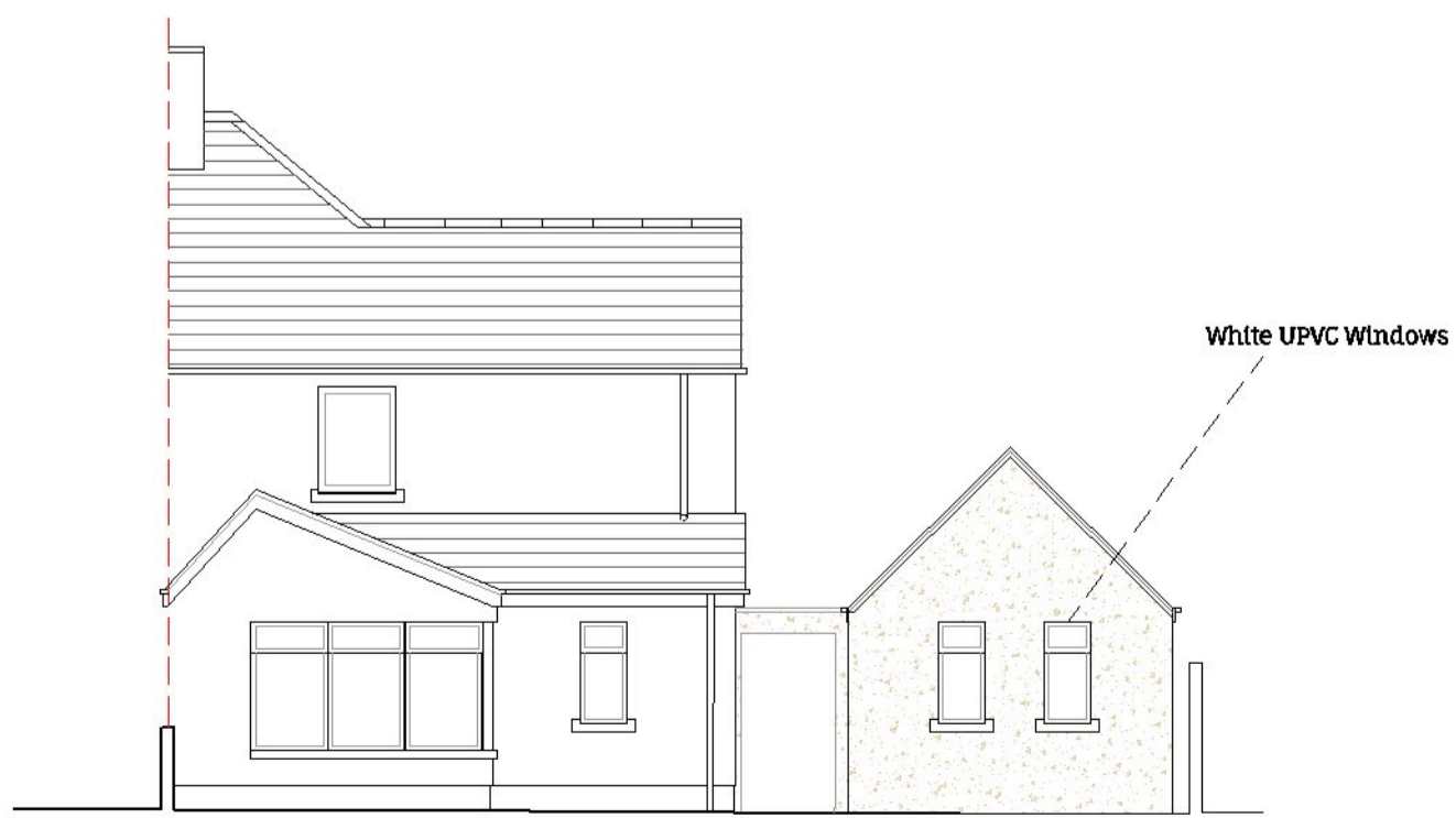
Proposed West Elevation 1:100

Office Address: 72 New Wynd Montrose, Angus, DD10 8RF Tel: 01674 672064 Email: info@crawfordarchitecture.co.uk Web: www.crawfordarchitecture.co.uk