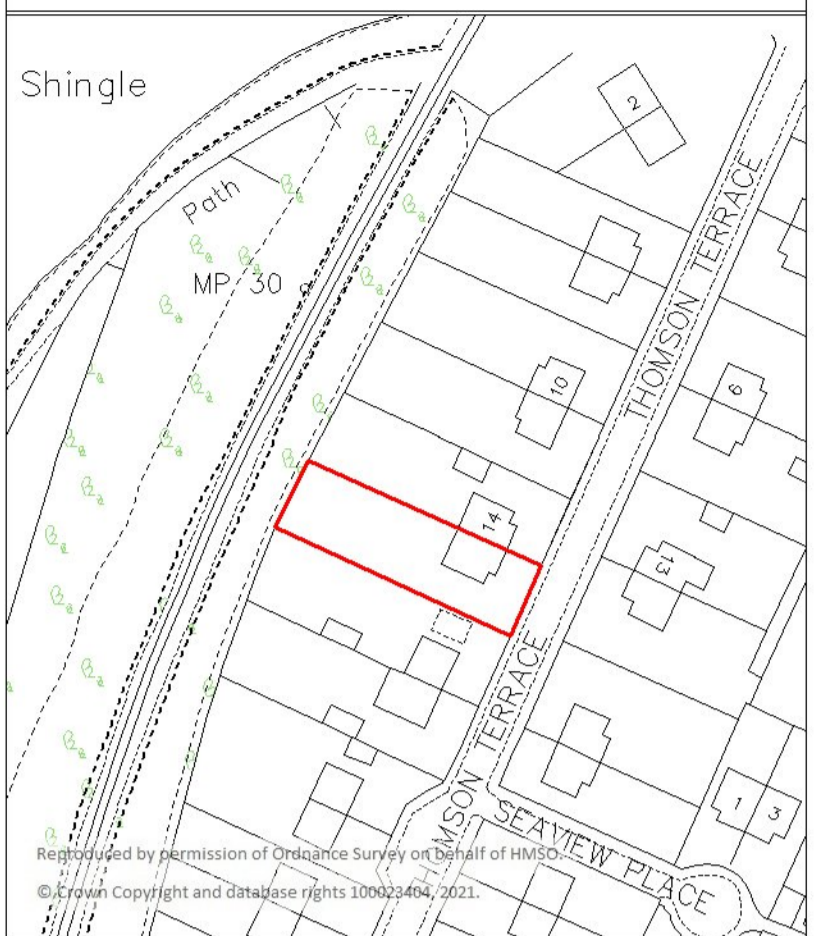
Proposed Location Plan 1:1250

Do not scale this drawing for construction purposes.